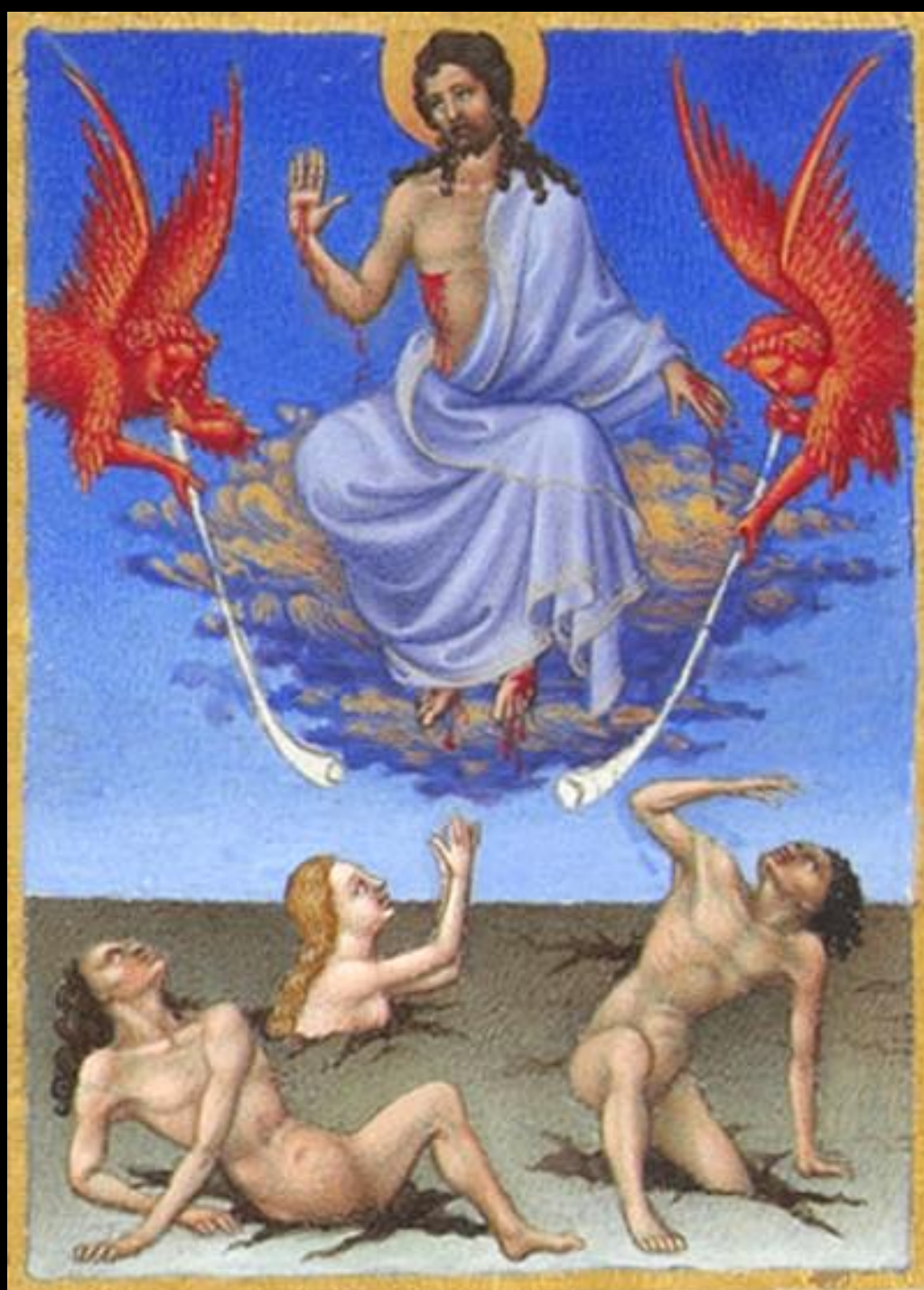
Resurrection of the Dead

Limbourg Brothers Musée Condé Chantilly, France