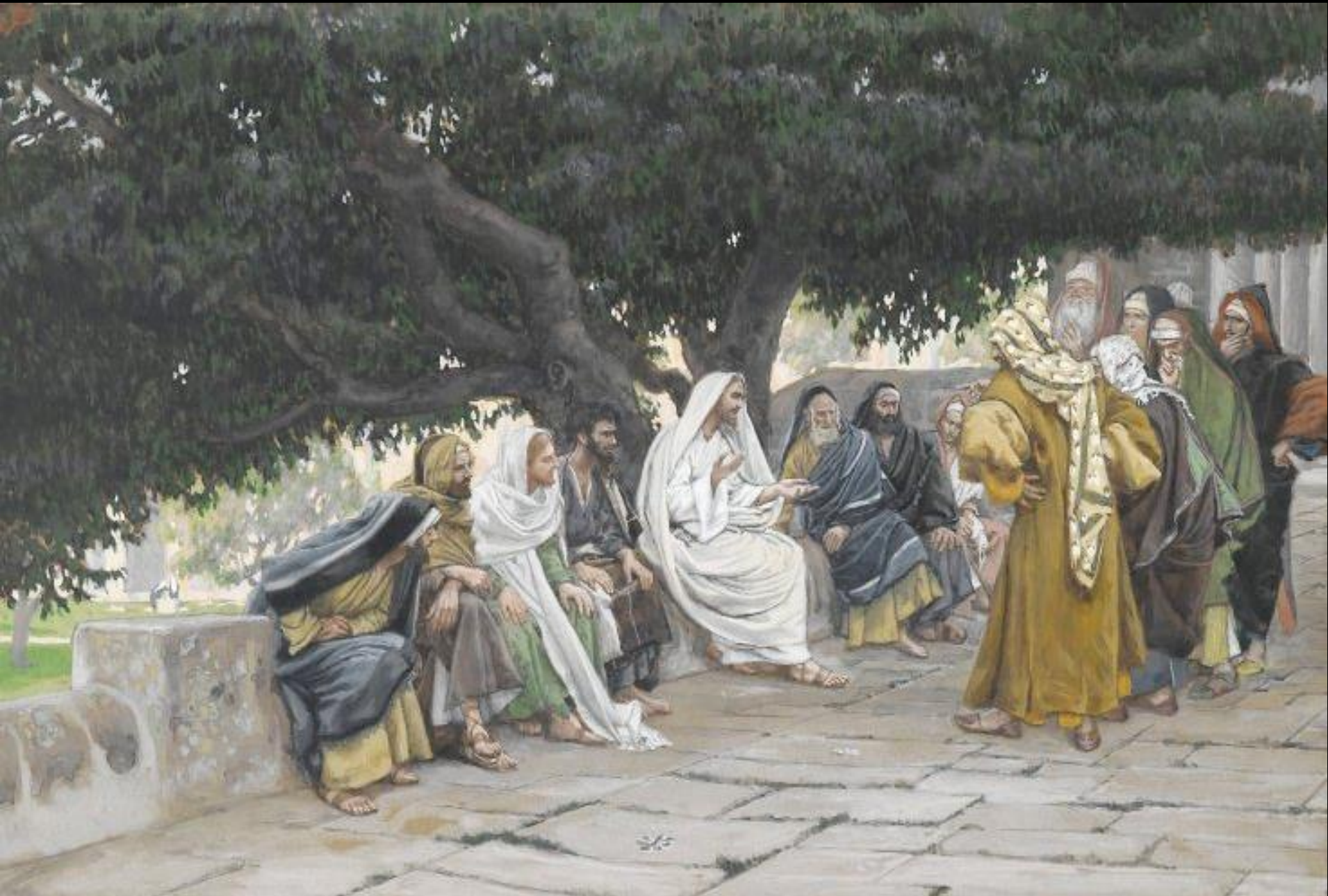
Pharisees and Sadducees Question Jesus -- James Tissot, Brooklyn Museum, New York, NY