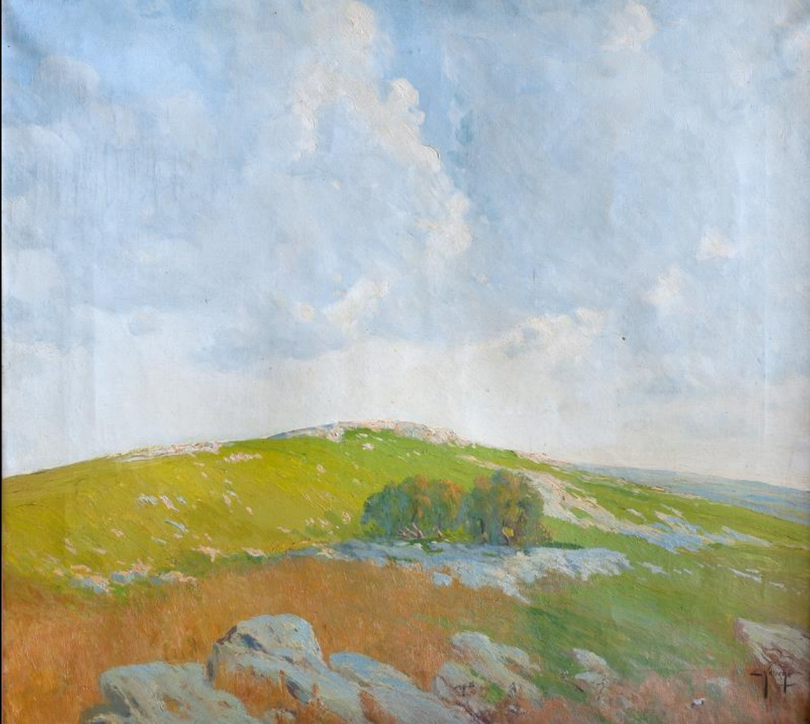
Summit of Cerro Arisco

Ernesto Larroche National Museum of Visual Arts Montevideo, Uruguay