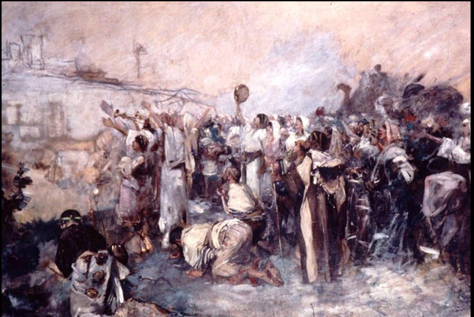
Miriam's Song after the Exodus from Egypt -- Samuel Hirszenberg, Yeshiva Museum, New York, NY