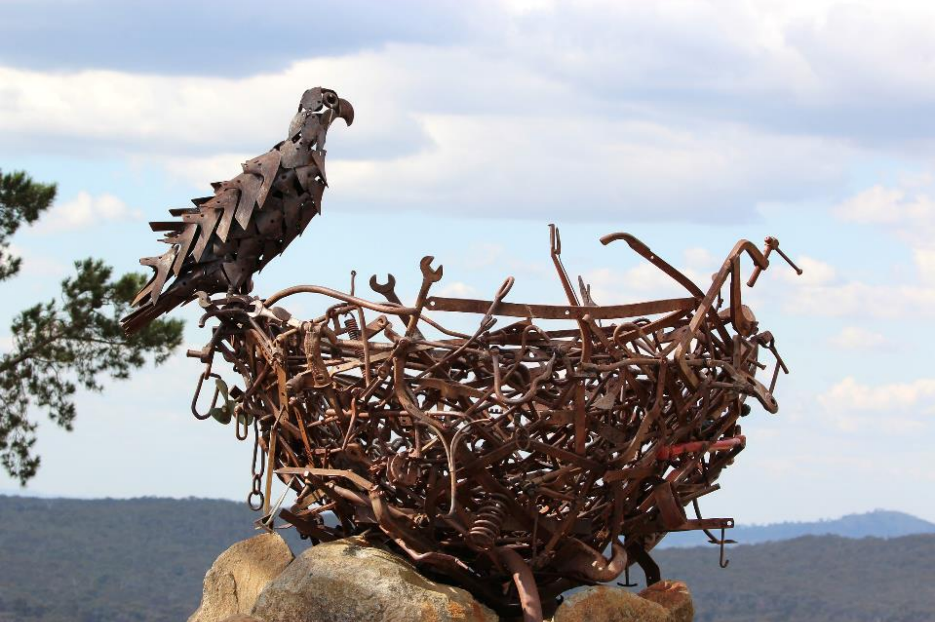
Eagle Protecting It's Nest -- National Arboretum, Canberra, Australia