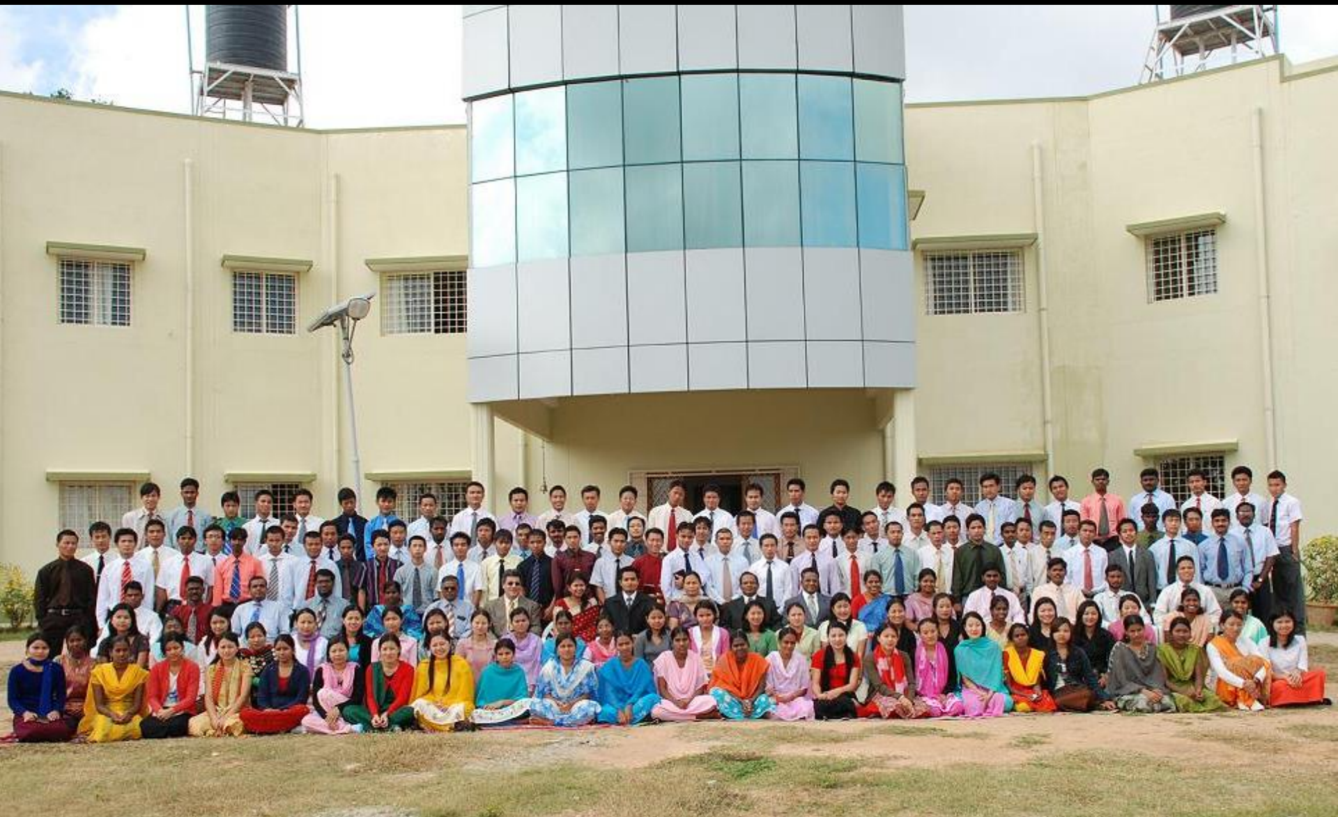
Maranatha Baptist Bible College and Seminary, Bangalore, India