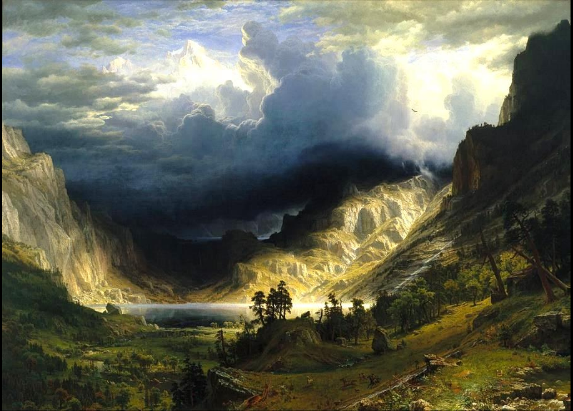
Storm in the Rocky Mountains -- Albert Bierstadt, Brooklyn Museum, New York, NY