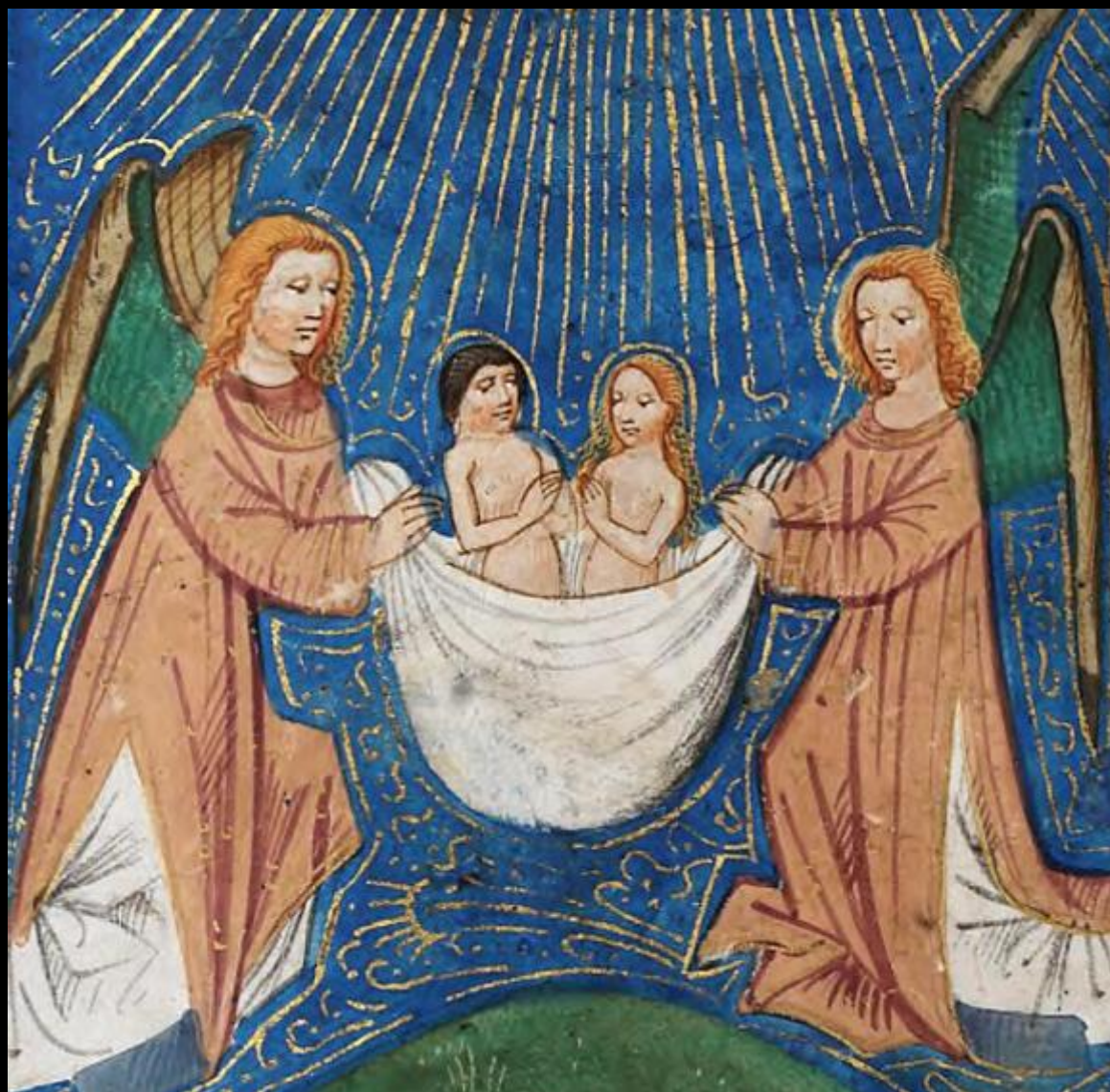
Souls Being Carried Up to Heaven

De Grey Hours National Library of Wales Aberystwyth, Wales