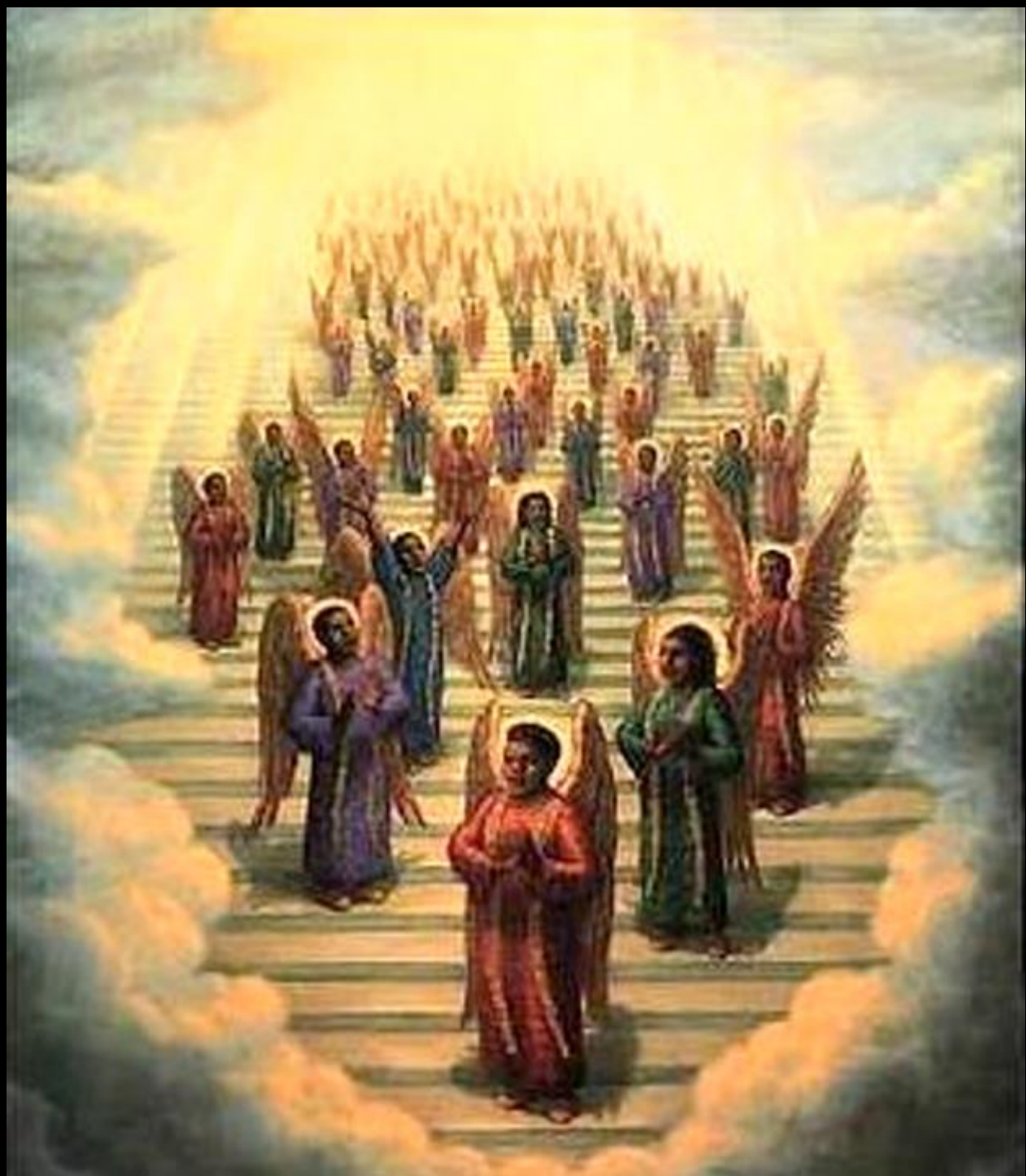
African- American Choir of Angels in Heaven