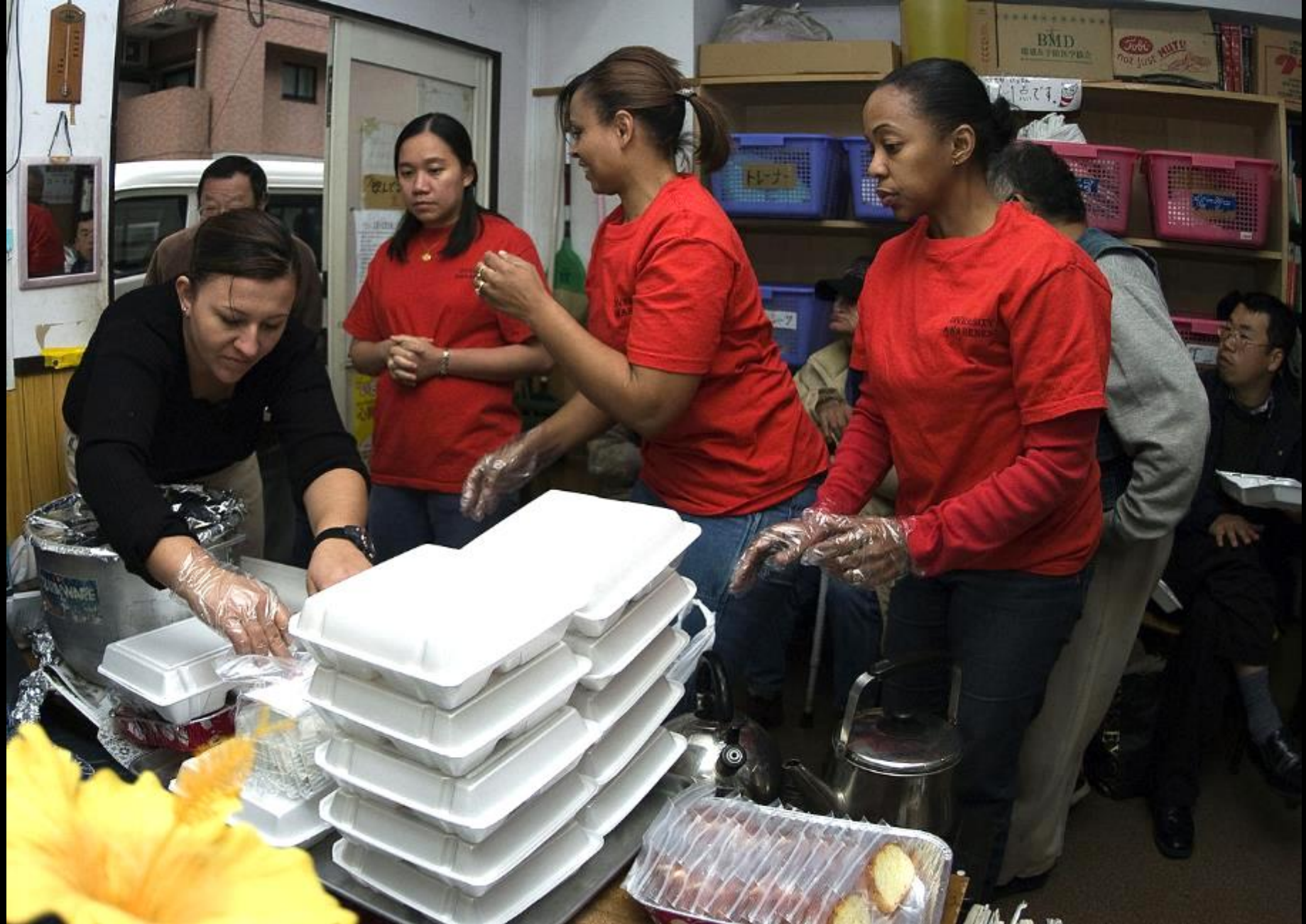
Preparing Meals for the Homeless -- U. S. Navy volunteers, Sanagi-tachi Shelter, Yokohama, Japan