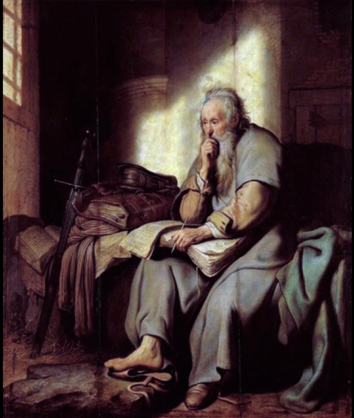
Paul in Prison

Rembrandt Staatsgalerie Stuttgart Stuttgart, Germany