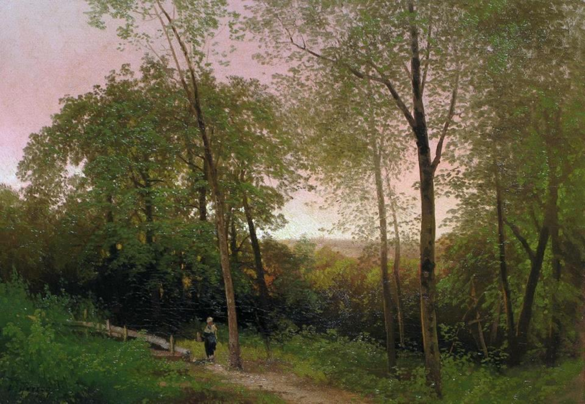
A Walk Along a Path at Sunset -- Hermann Herzog, Vose Galleries, Boston, MA