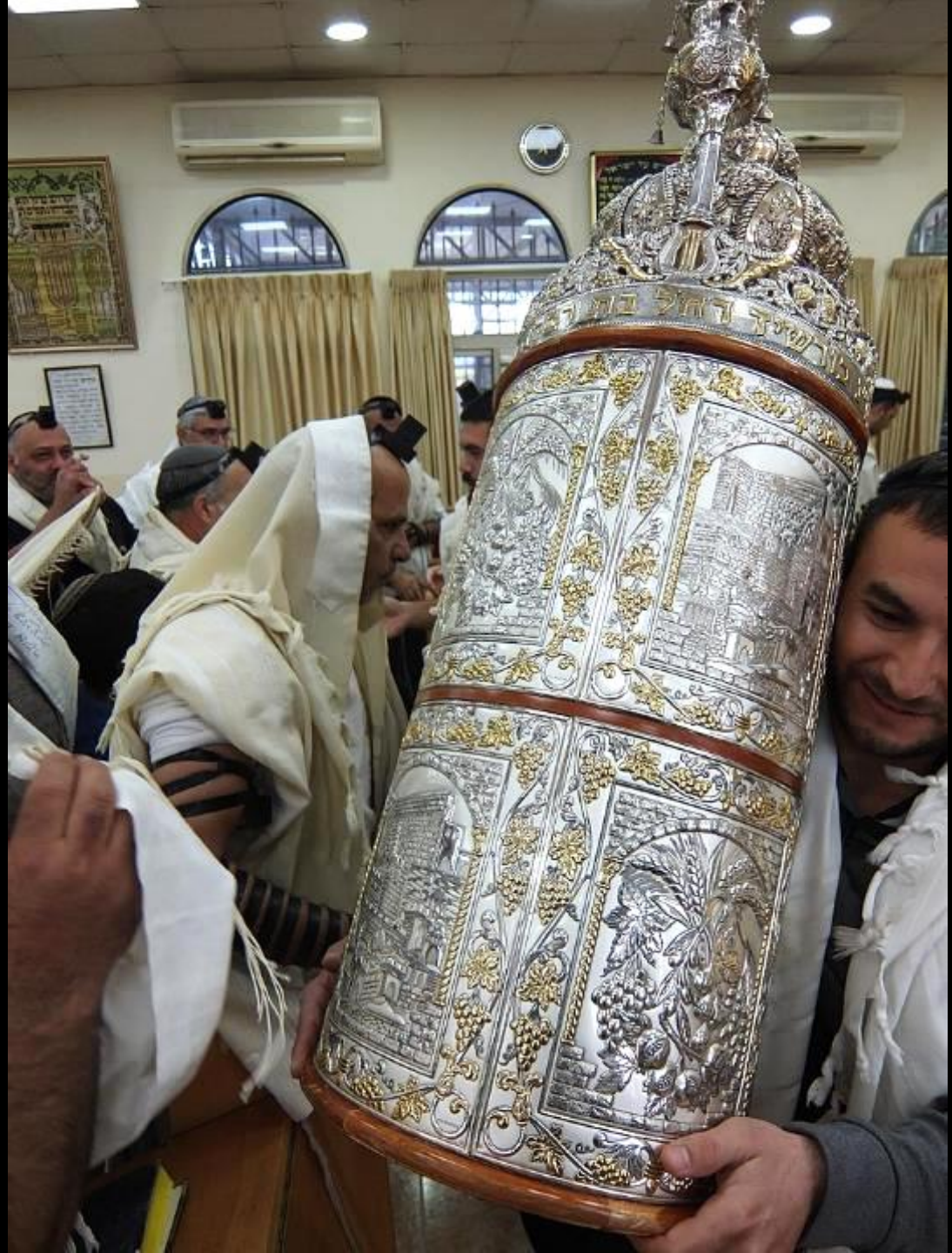
Silver and Gold Torah Case