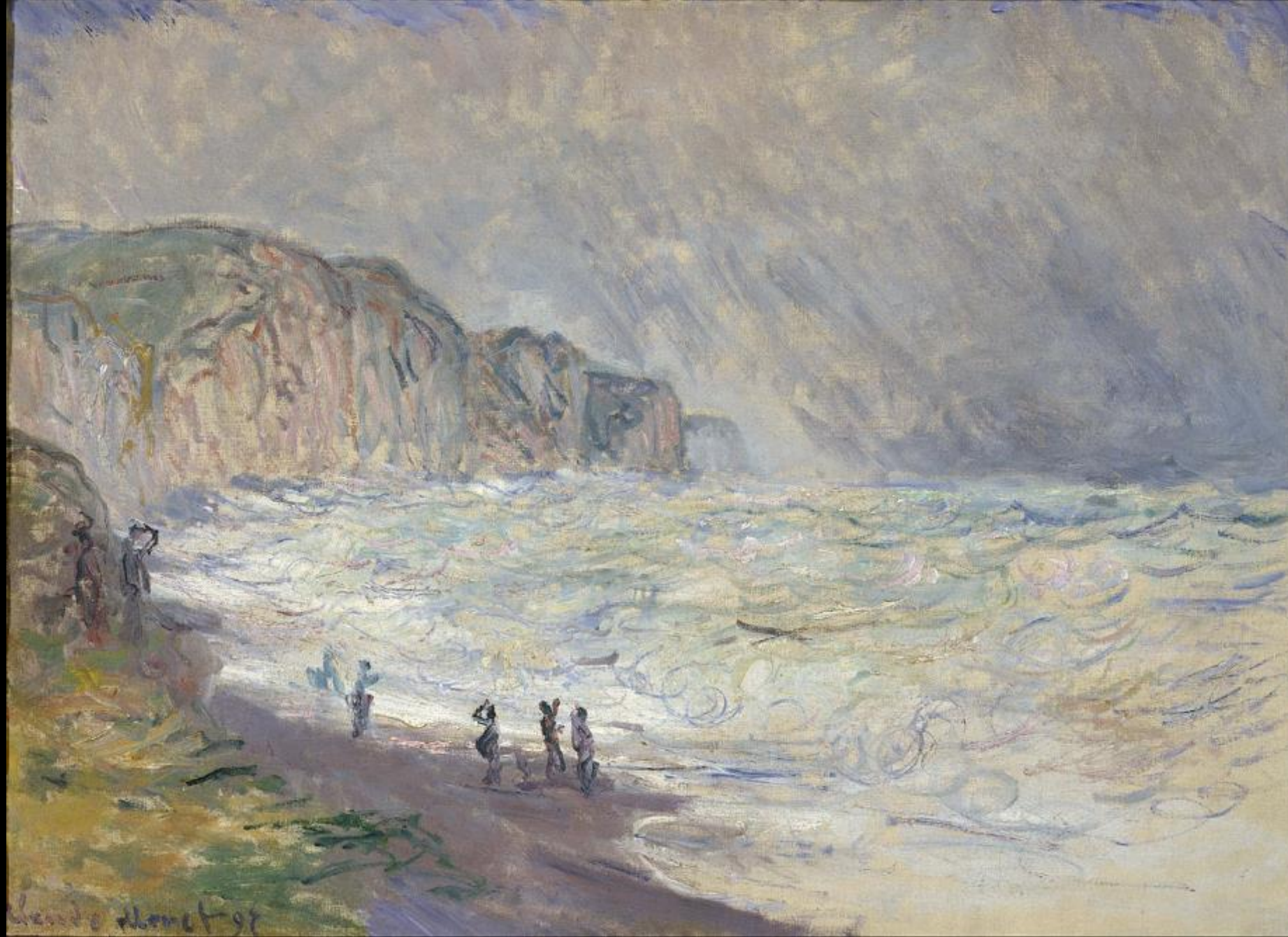
Heavy Sea at Pourville -- Claude Monet, National Museum of Western Art, Tokyo, Japan