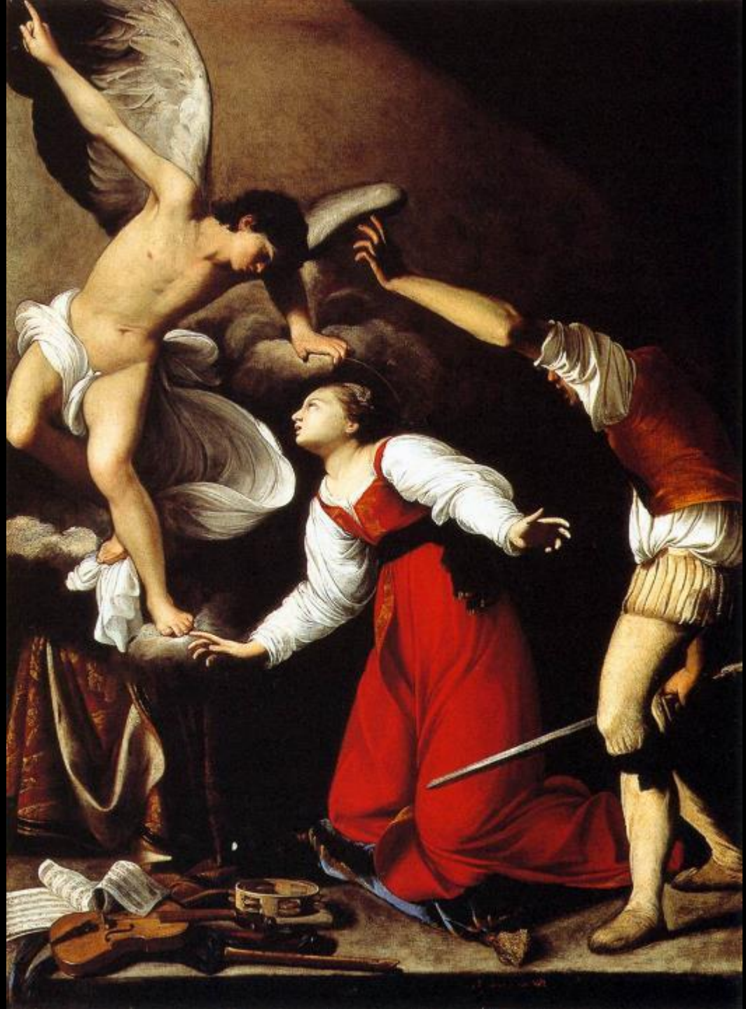
The Martyrdom of St. Cecilia

Carlo Saraceni Los Angeles County Museum of Art Los Angeles, CA