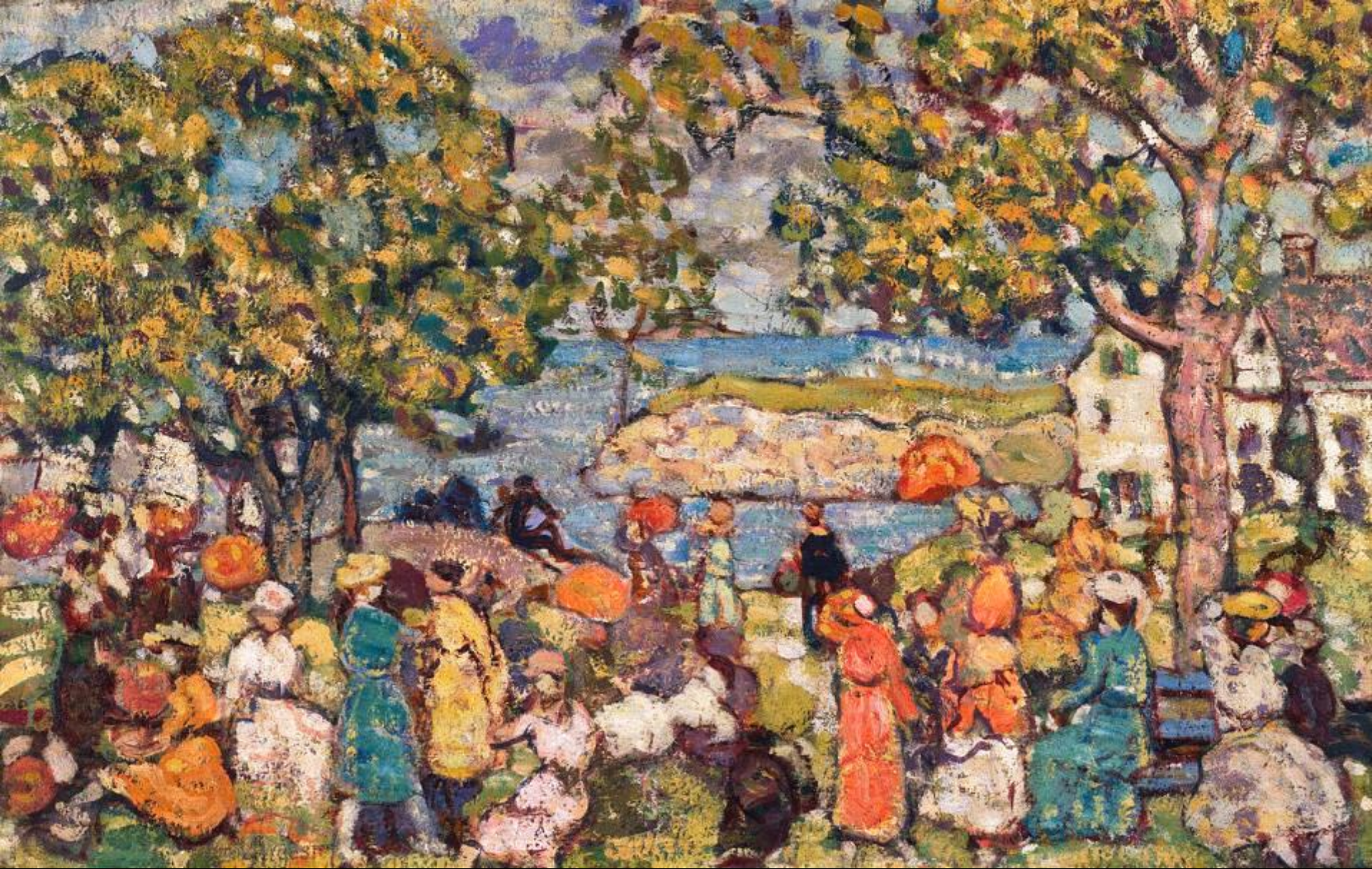
The Picnic -- Maurice Prendergast, Phillips Collection, Washington, DC