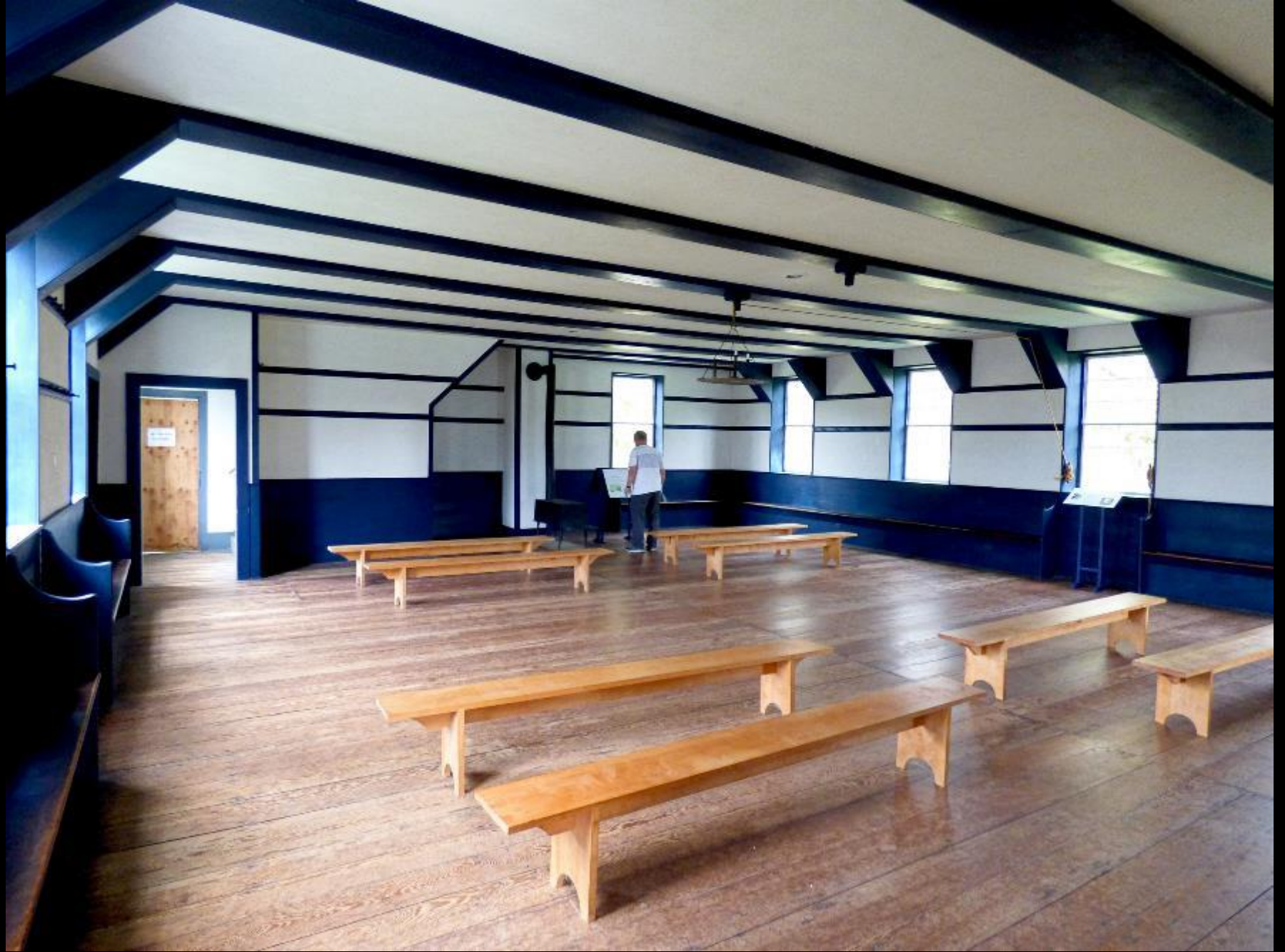
Meeting House Worship Space, Hancock Shaker Village, Pittsfield, MA