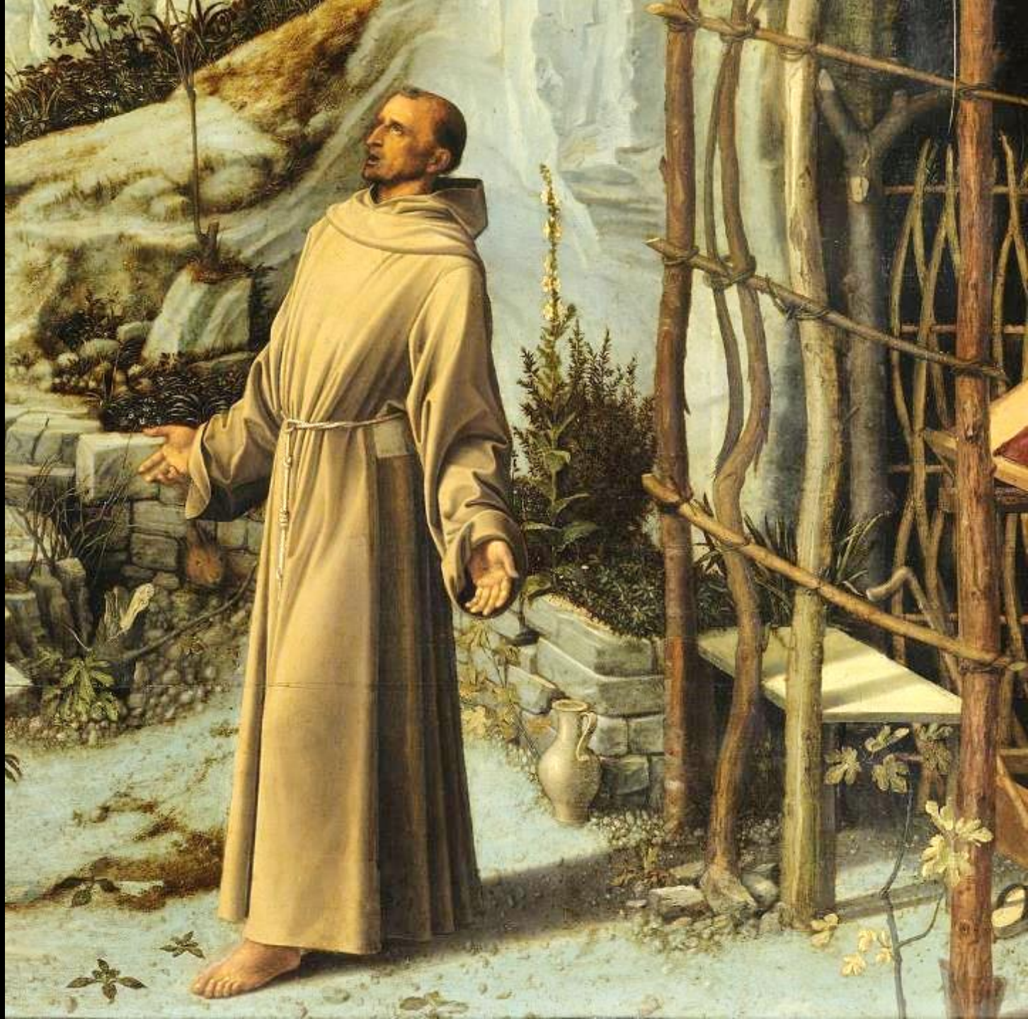
St. Francis in the Desert, detail

Giovanni Bellini Frick Collection New York, NY