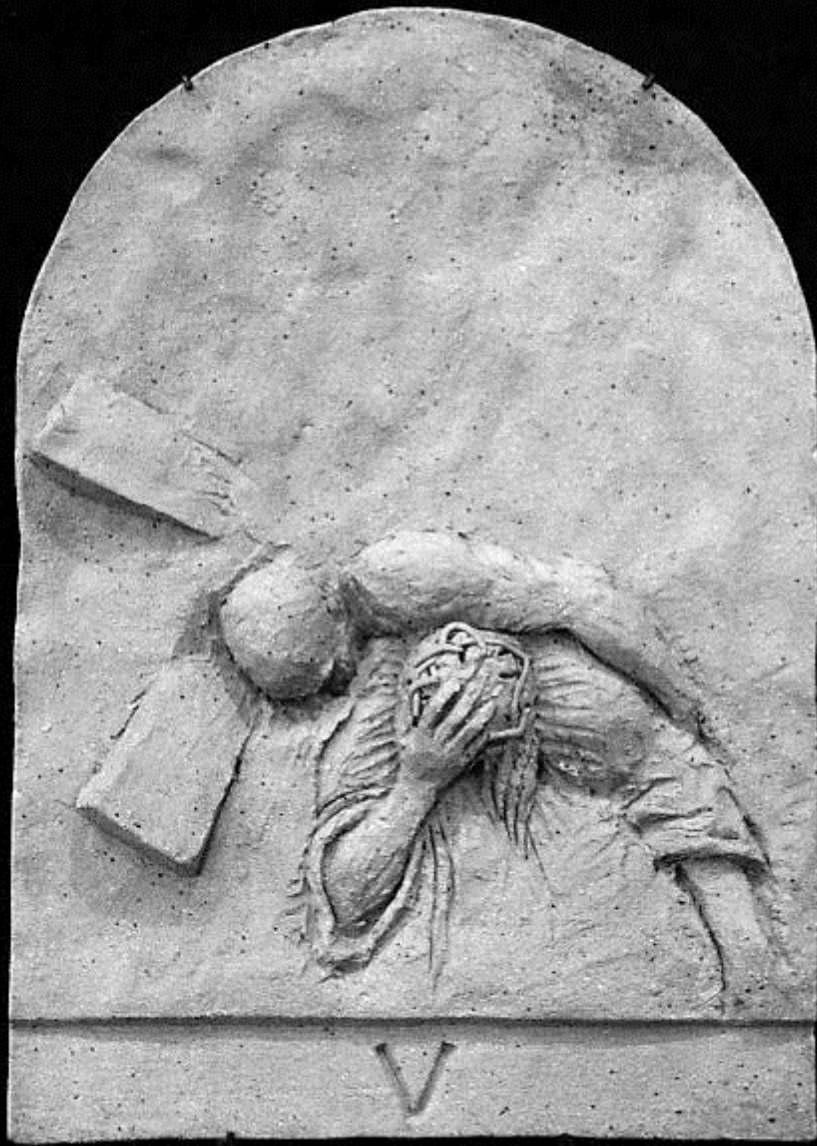
Simon of Cyrene Helps Christ, Stations of the Cross -- Good Shepherd Church, Cedar Hill, TX