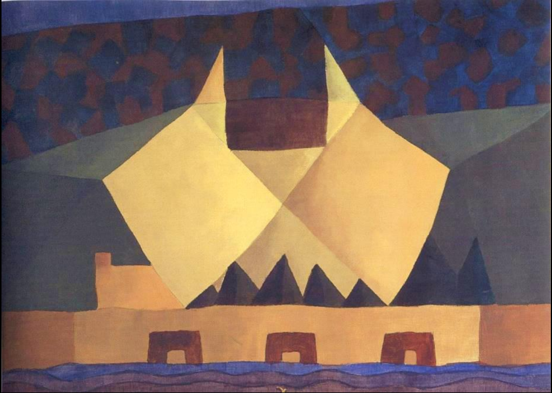
Two Brothers -- Arthur Dove, Honolulu Museum of Art, Honolulu, HI