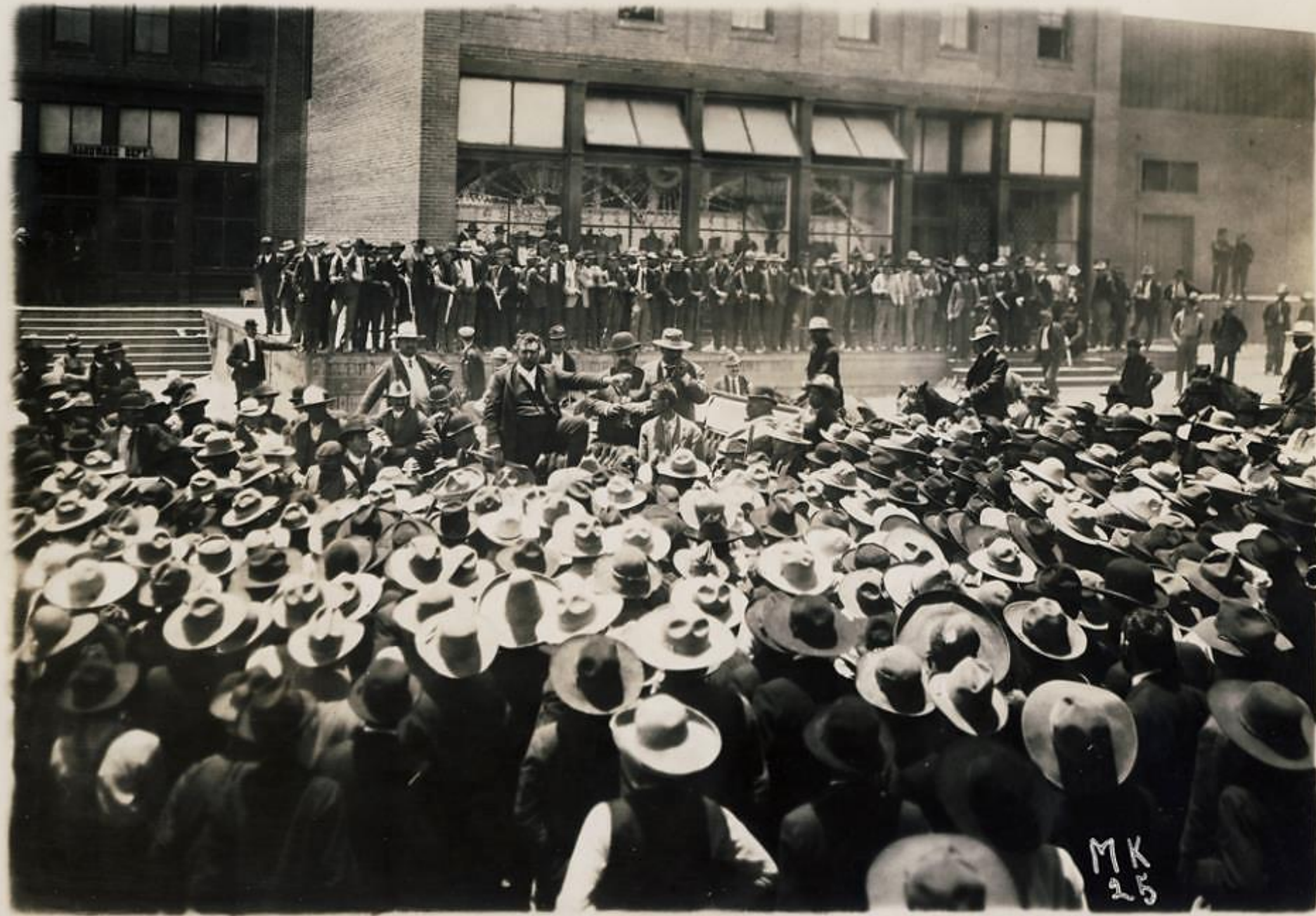
Mexican Workers During Miners' Strike, 1906, Cananea, Mexico