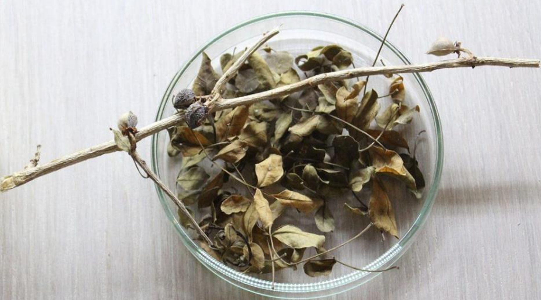
The herb "Balm of Gilead" -- from "Jerusalem: A Medical Diagnosis Exhibition", Israel