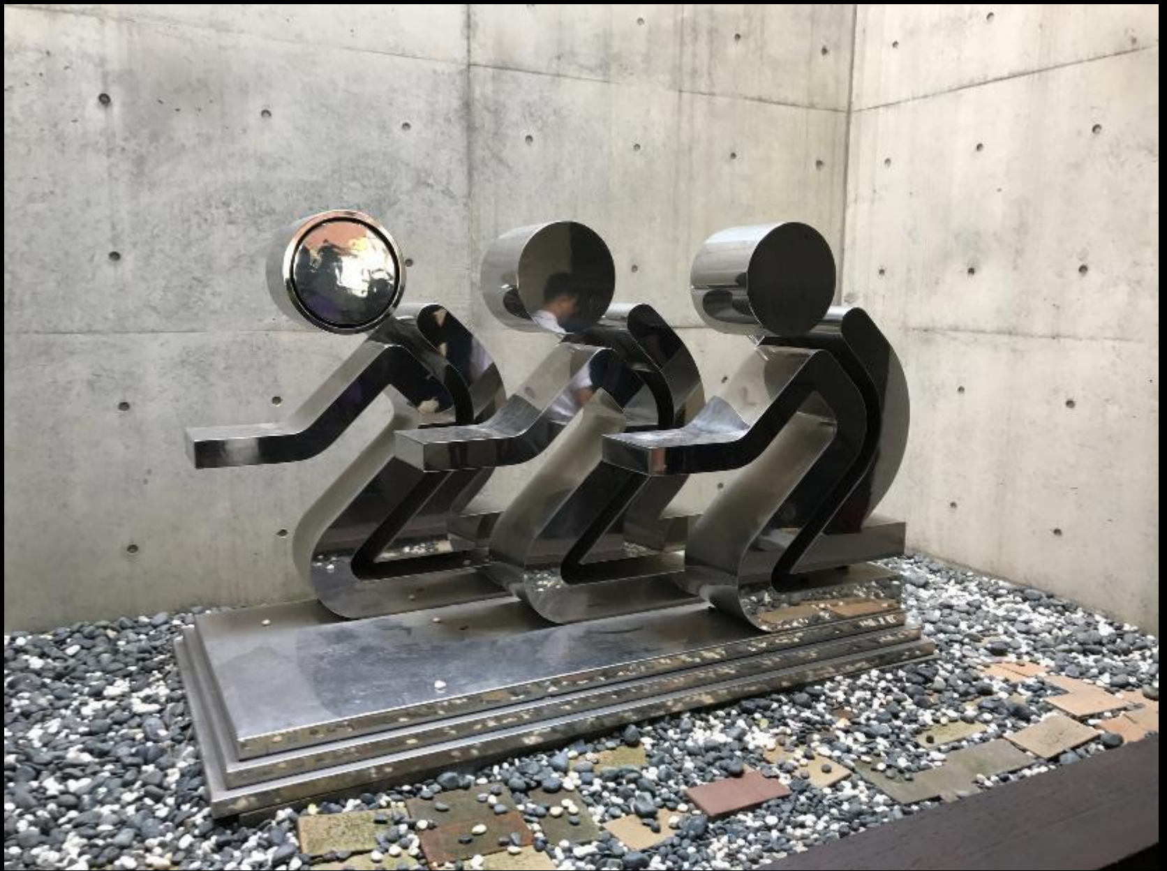
Prayer Sculpture, Kipun (Joyful) Methodist Church, Pyeongtaek, South Korea