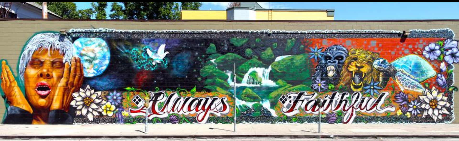
Always Faithful -- Mural, Oakland, CA