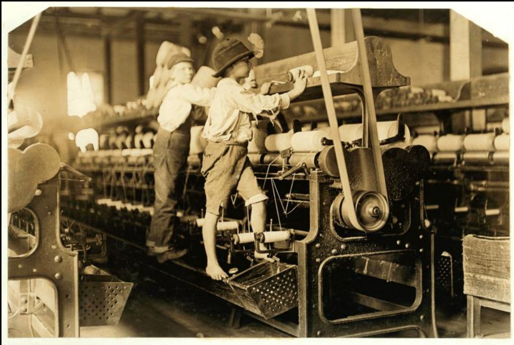
Mill Children in Macon, Georgia -- Lewis Hine, 1909, Library of Congress, Washington, DC