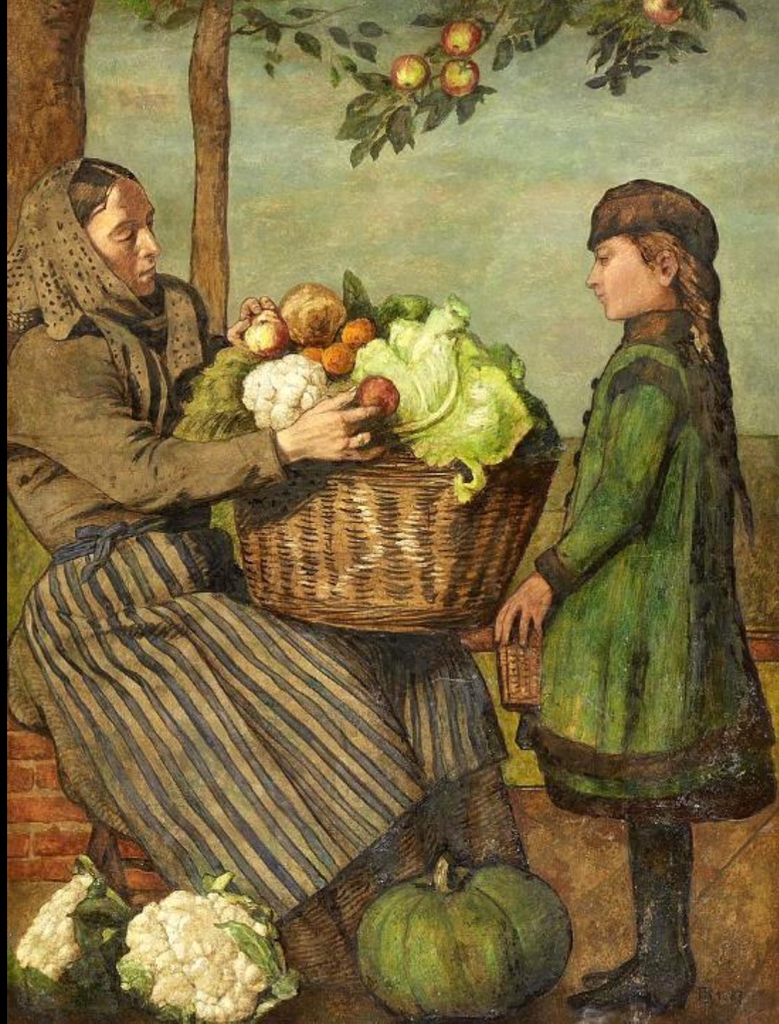
Grandmother and Granddaughter with a Vegetable Basket