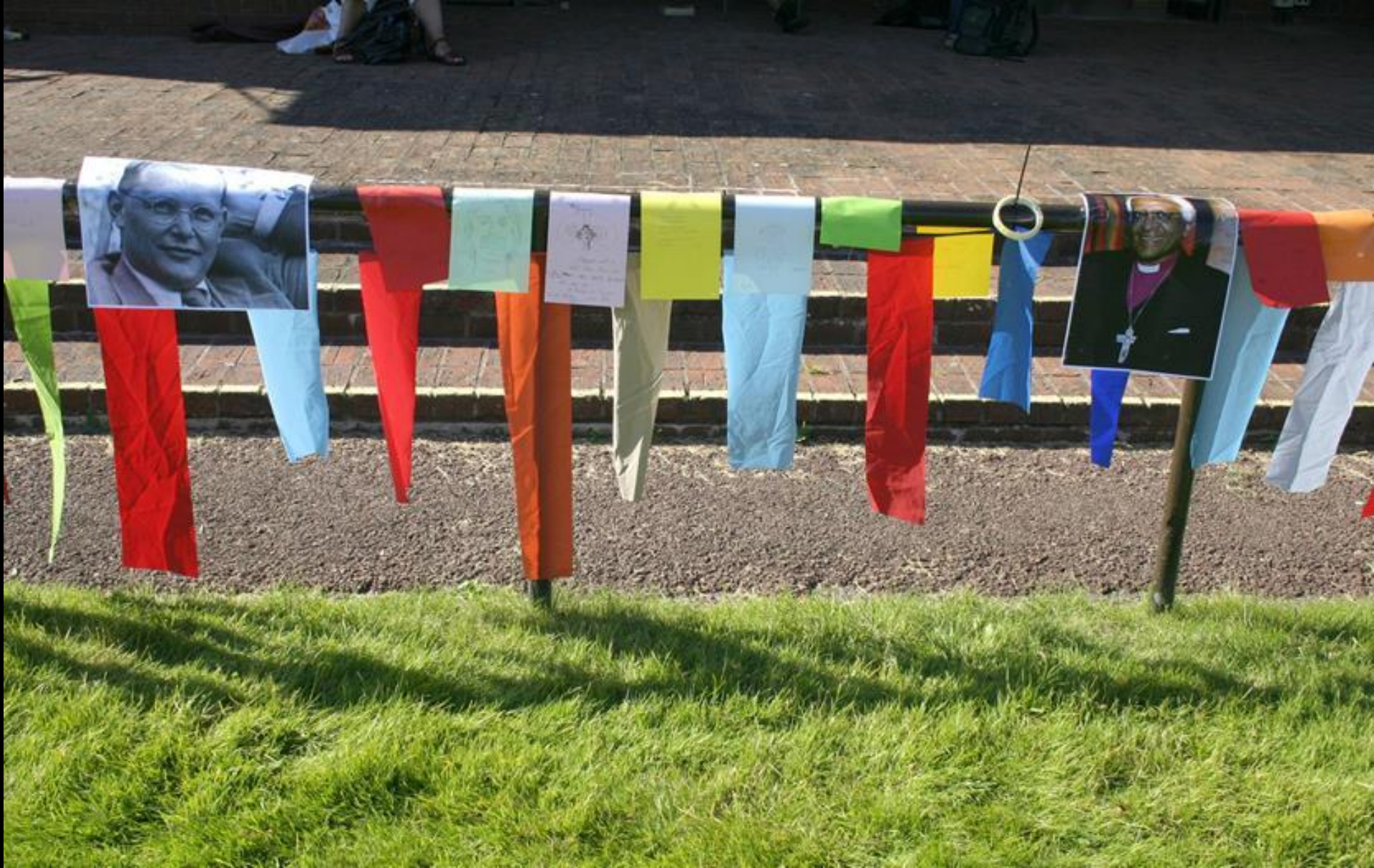
"Placing yourself in god's story, among the heroes of the faith (Niebhur, Tutu...) Emerging Church Festival, Cheltenham, England