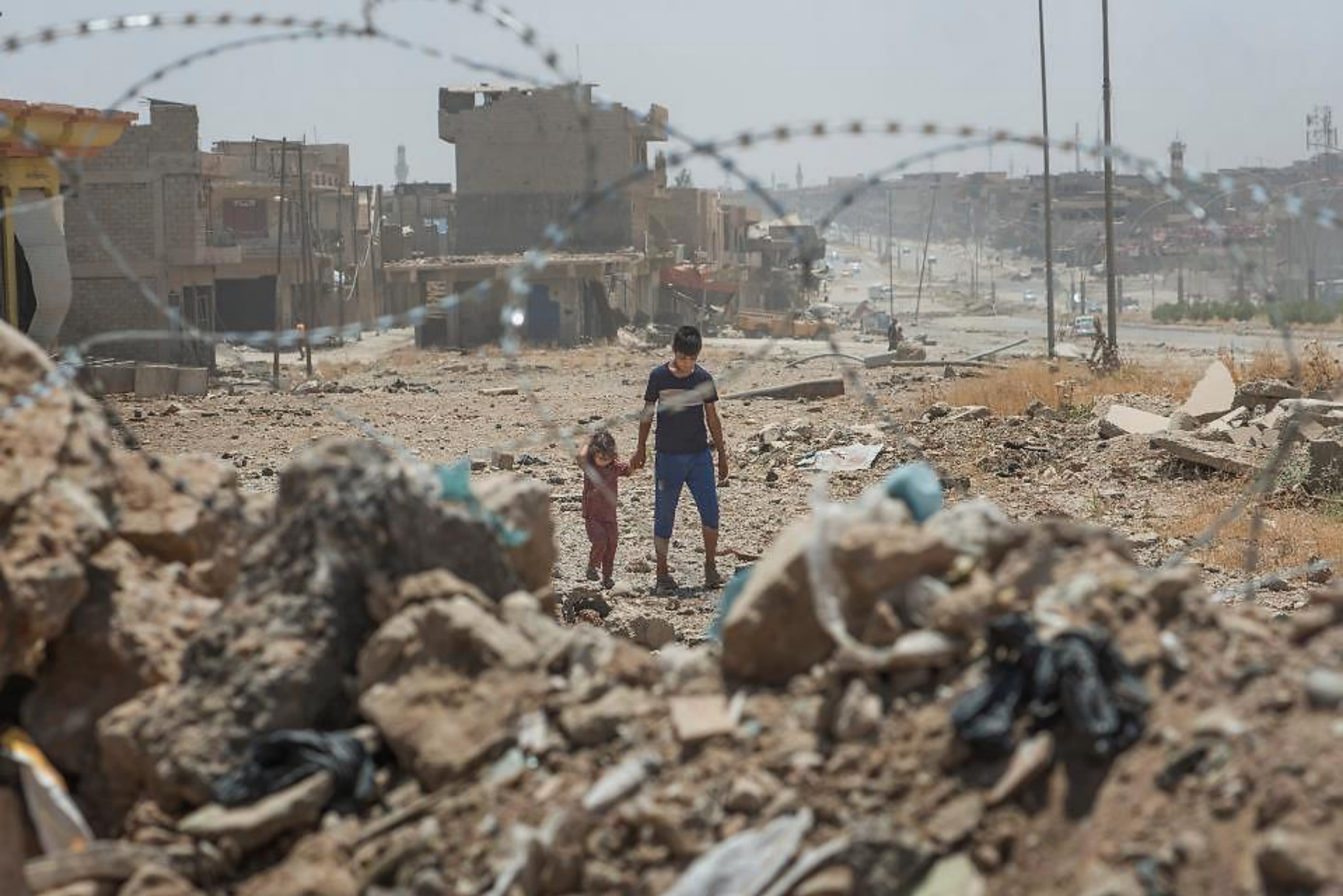
Brother and Sister Walk in War-torn Mosul, Iraq -- EU Civil Protection Service, 2017