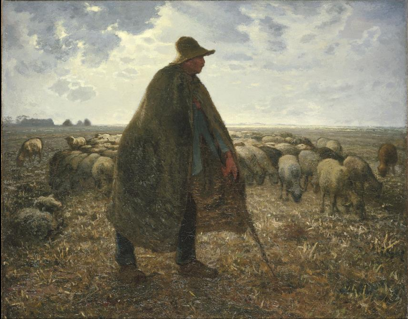
Shepherd Tending His Flock -- Jean-François Millet, Brooklyn Museum, New York, NY