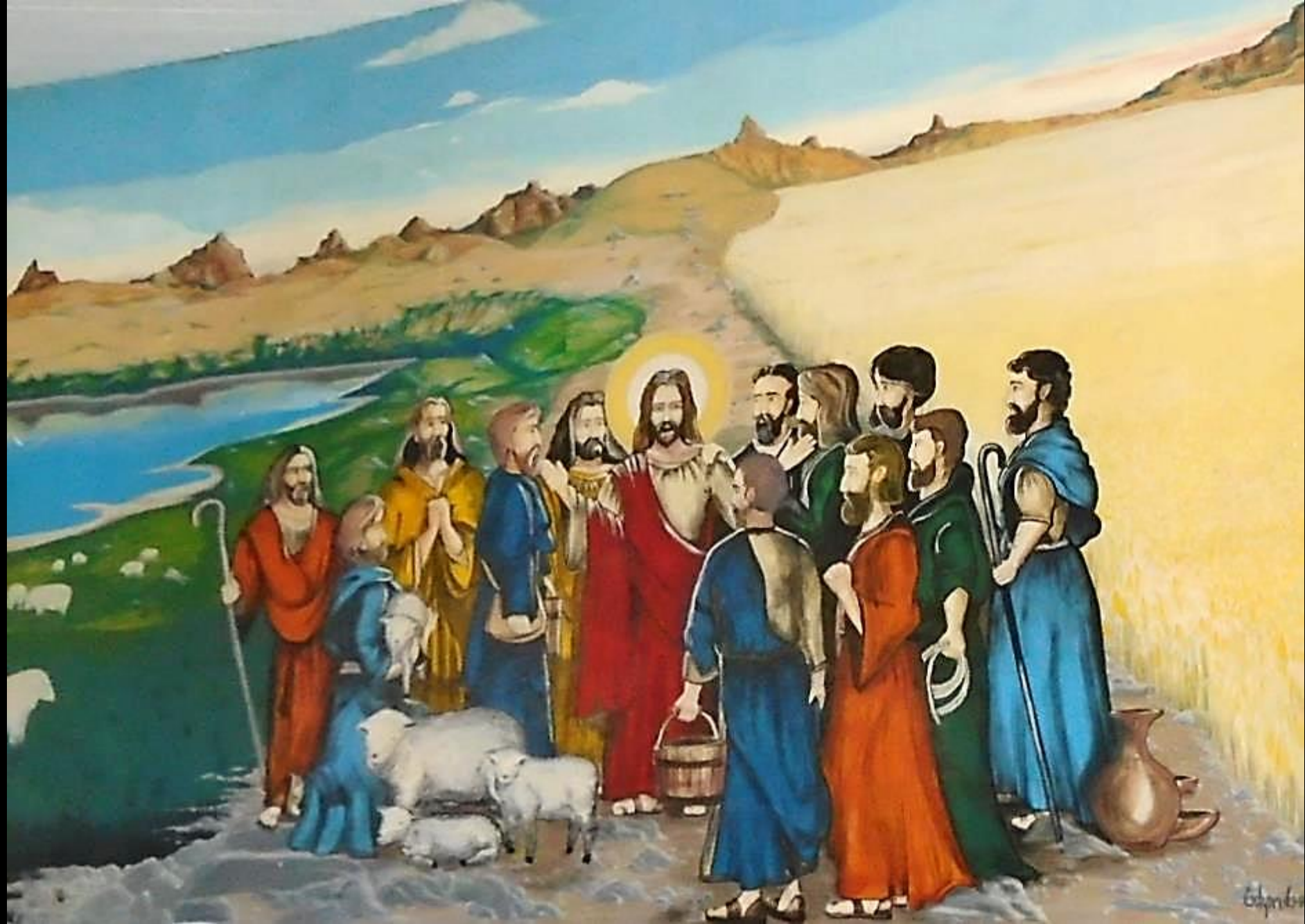
Christ with the Apostles -- Mural, Catedral São Francisco Xavier (Joinville, Brasil)