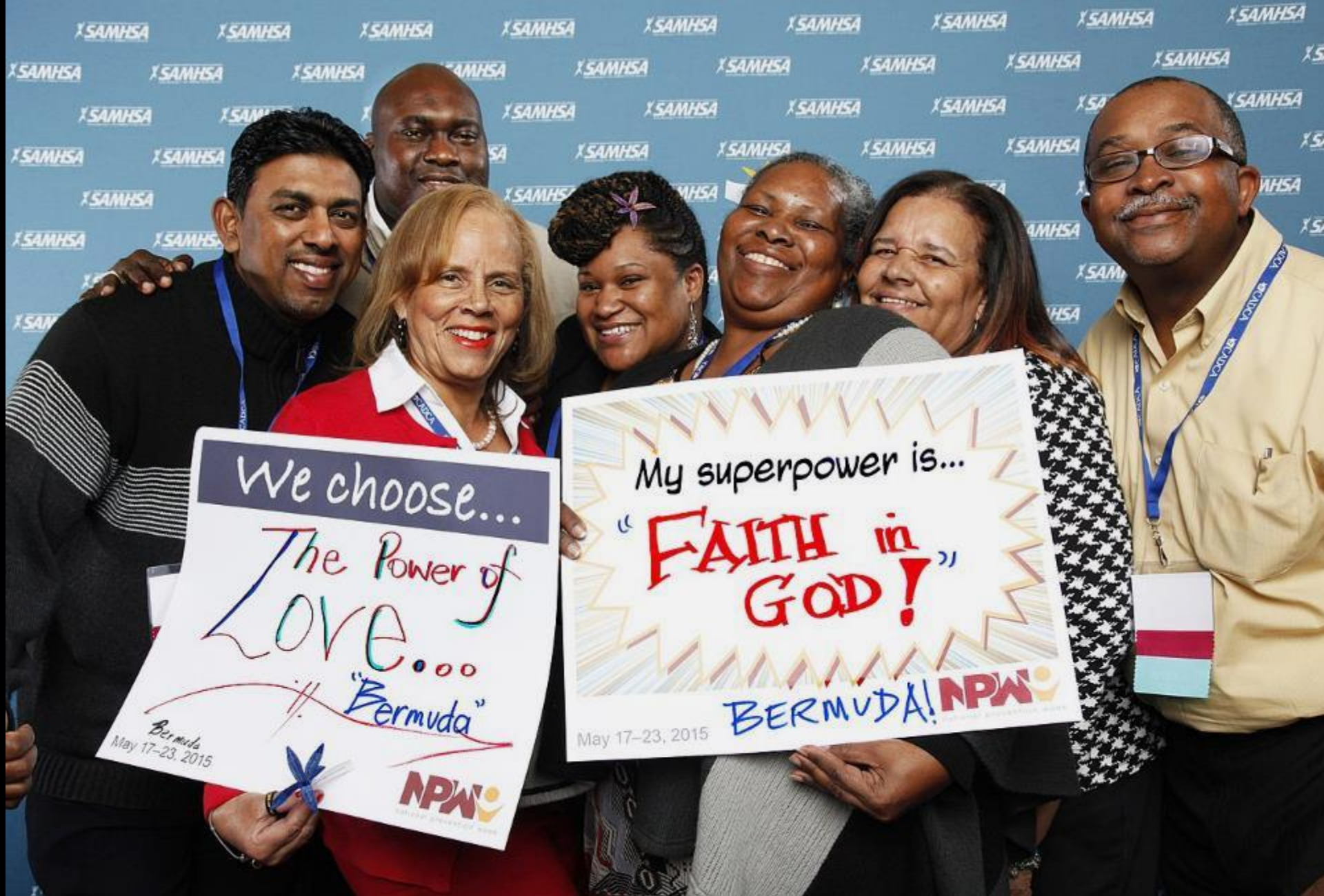
The Power of Love -- SAMSHA, Rockville, MD