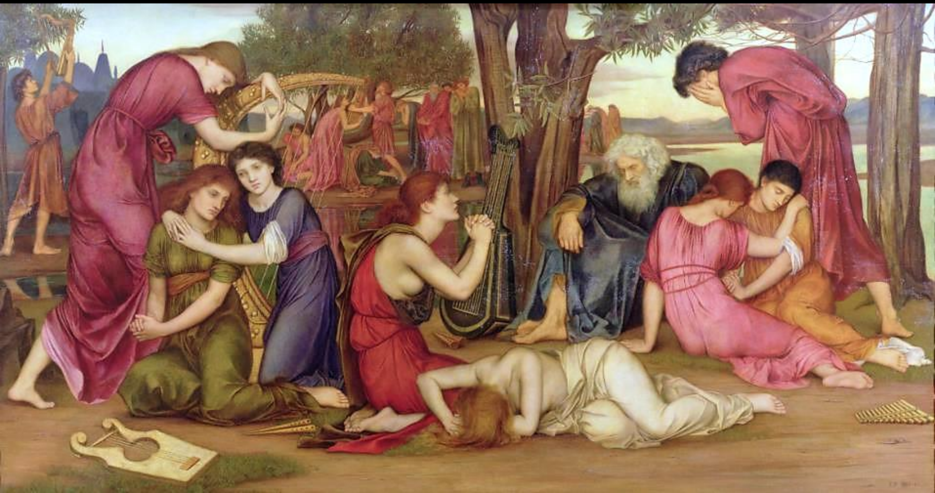
"By the Waters of Babylon", Psalm 137 -- Evelyn de Morgan, De Morgan Foundation, UK