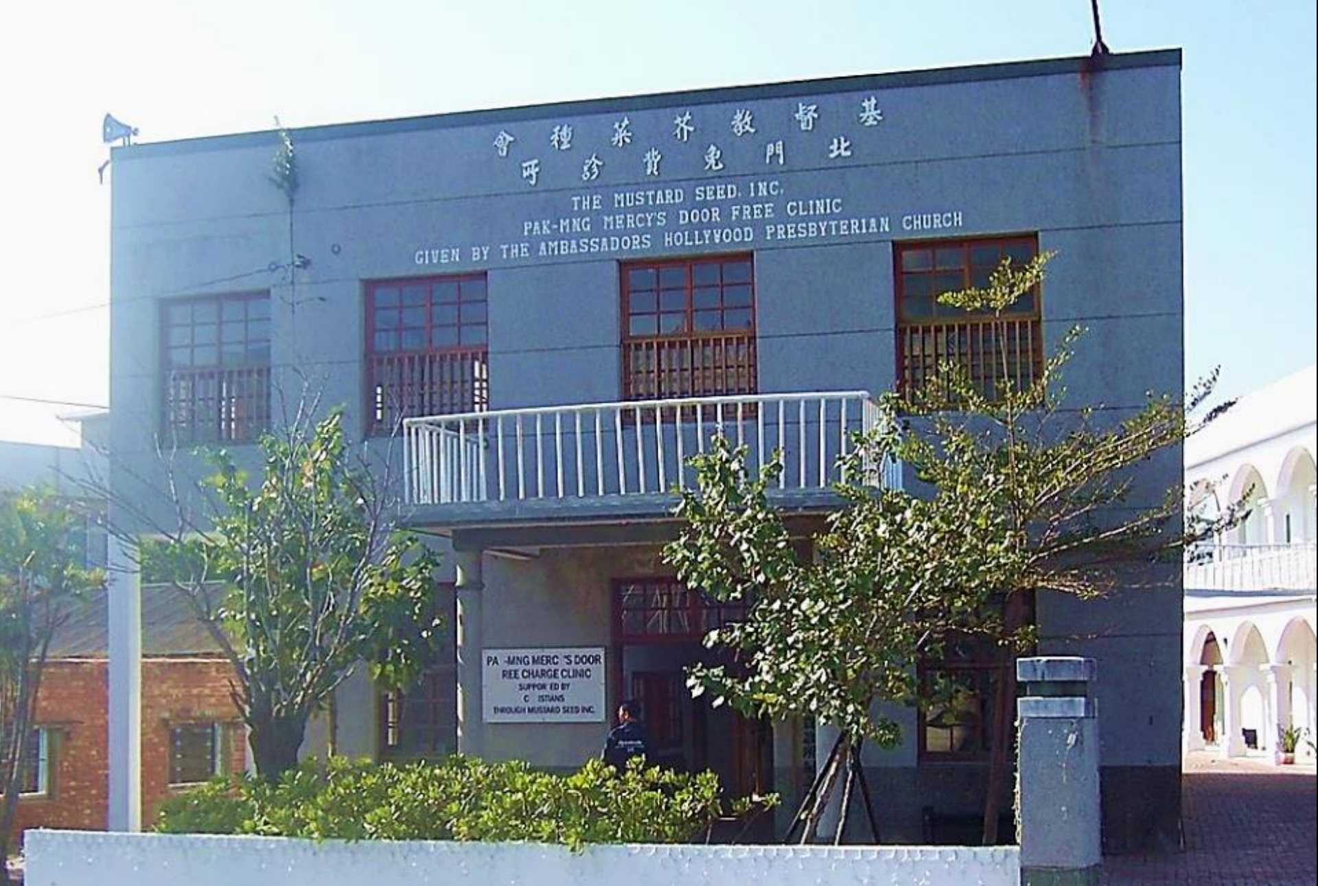
"Mustard Seed" Free Clinic -- Beimen, Taiwan