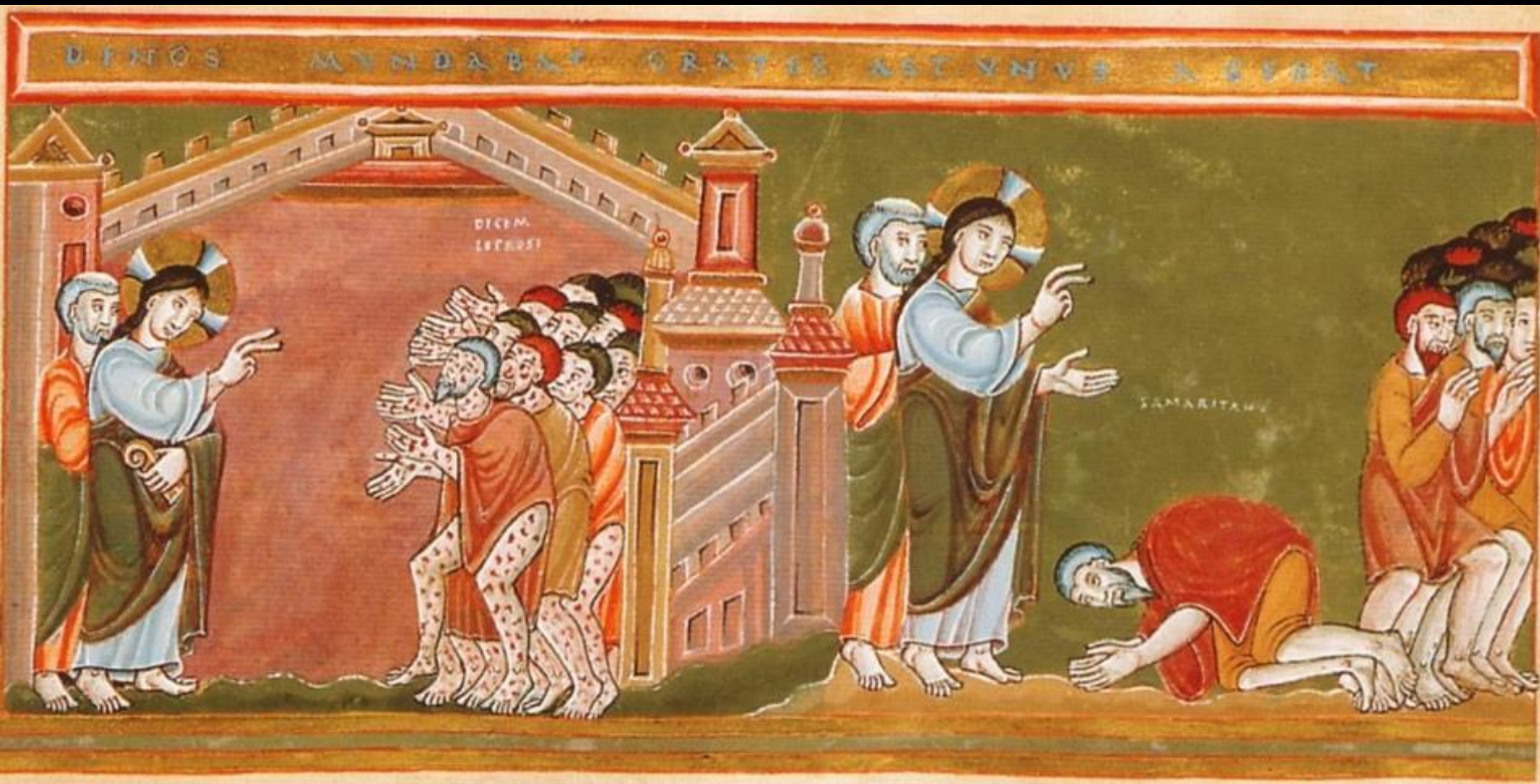
Christ and the Ten Lepers -- Codex Aureus Epternacensis, Freising, Germany