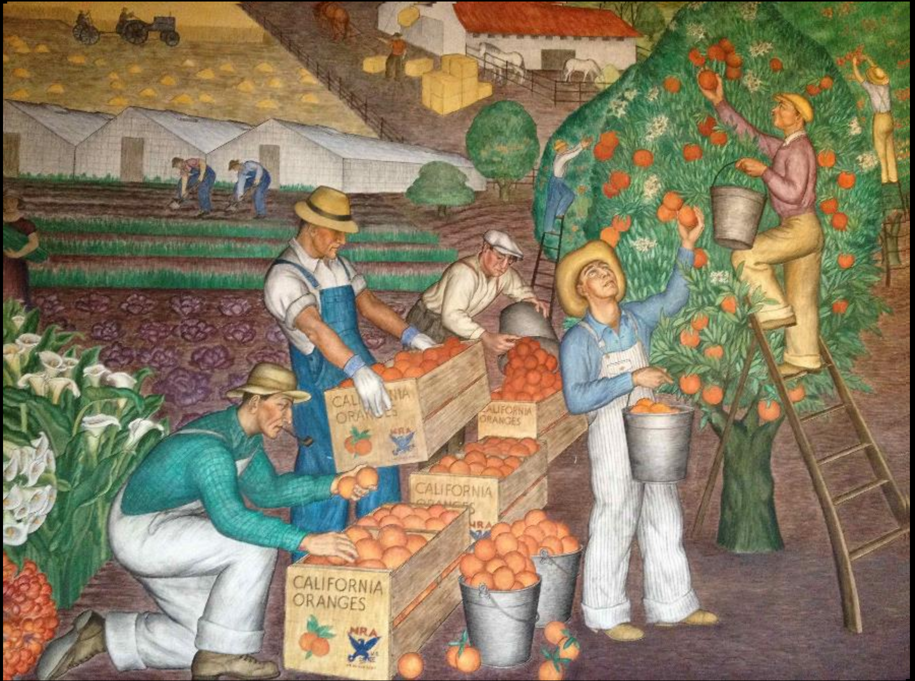
Migrant Farm Workers -- Mural, Coit Tower, San Francisco, CA