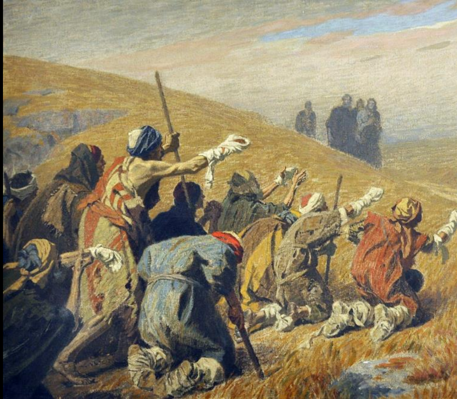
Ten Lepers Call Out to Jesus, detail -- Gebhard Fugel, Diocesan Museum, Freising, Germany