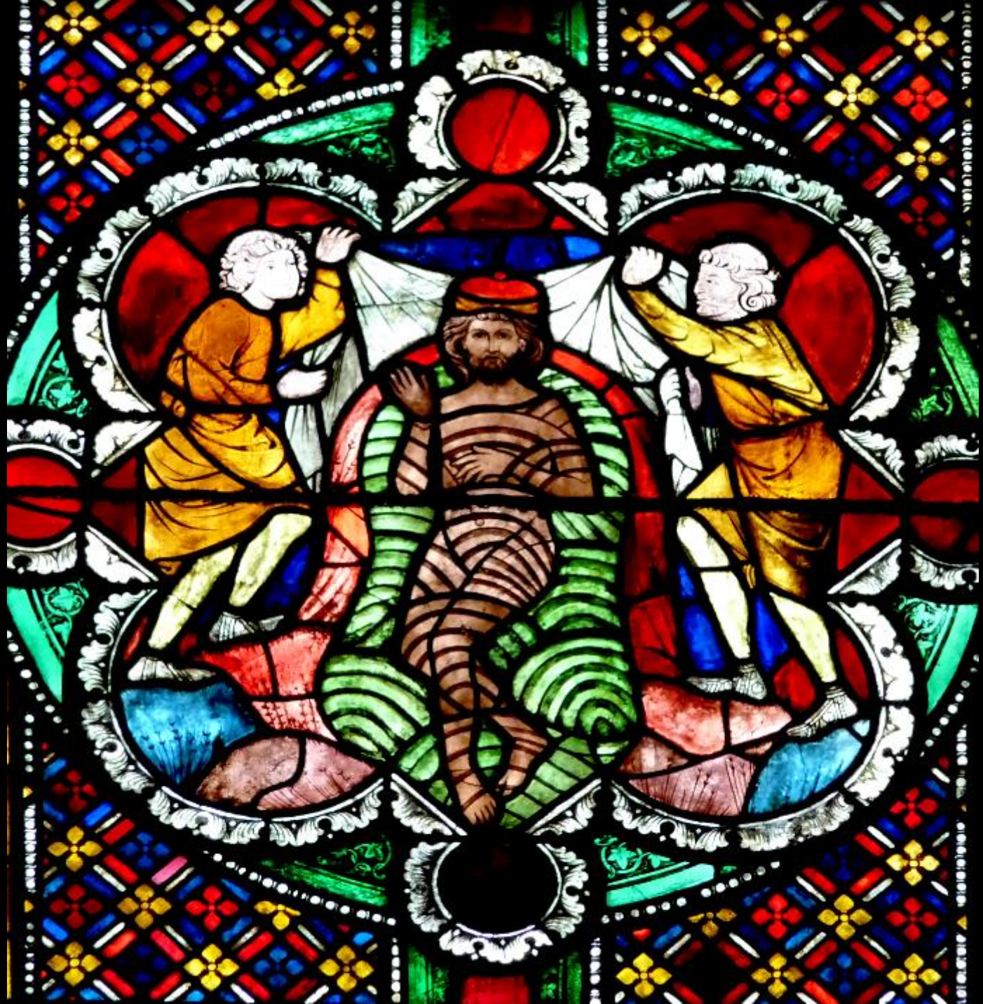
Naaman Bathes in the Jordan