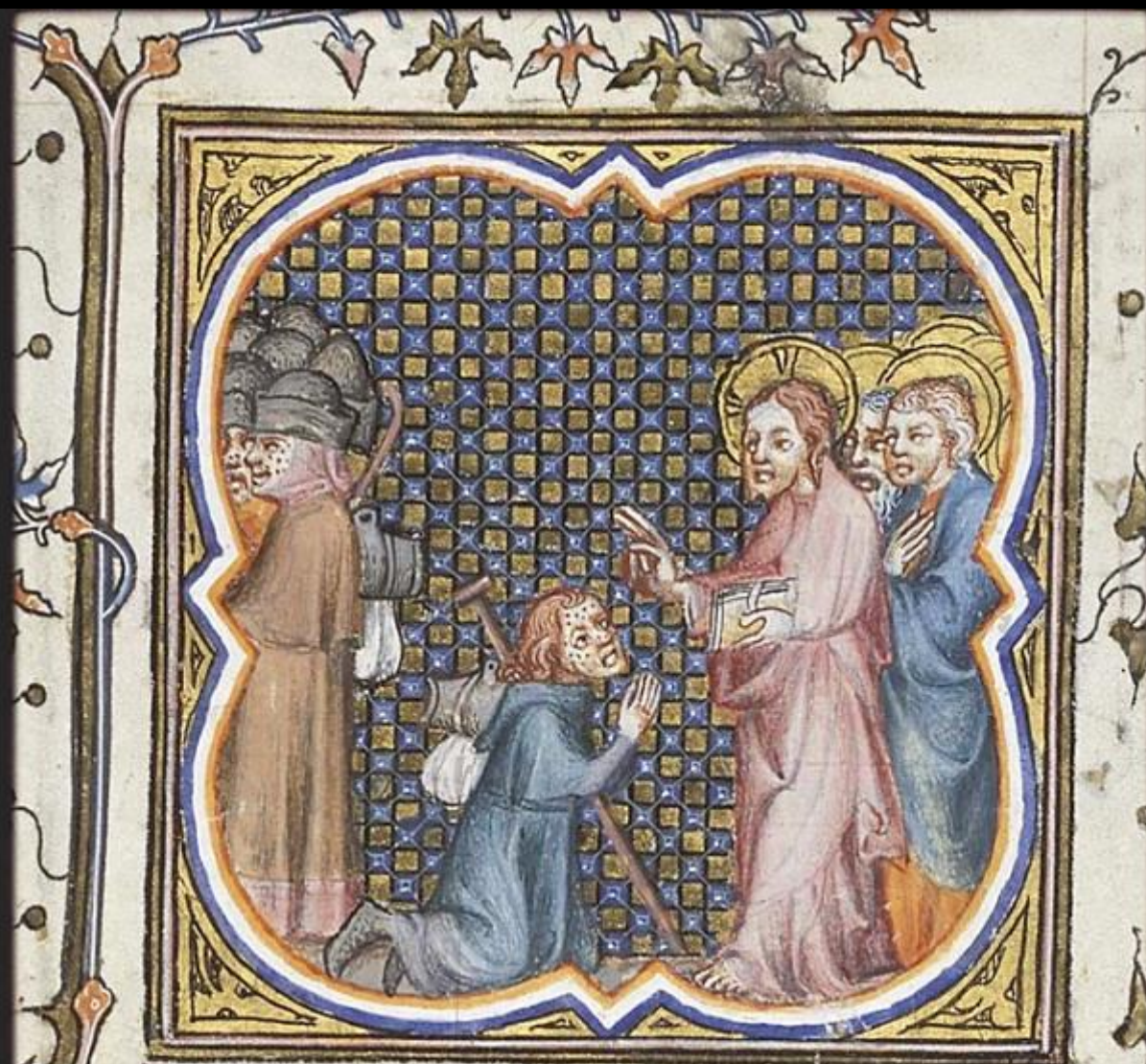
Christ Heals the Ten Lepers

National Library of the Netherlands Hague, Netherlands