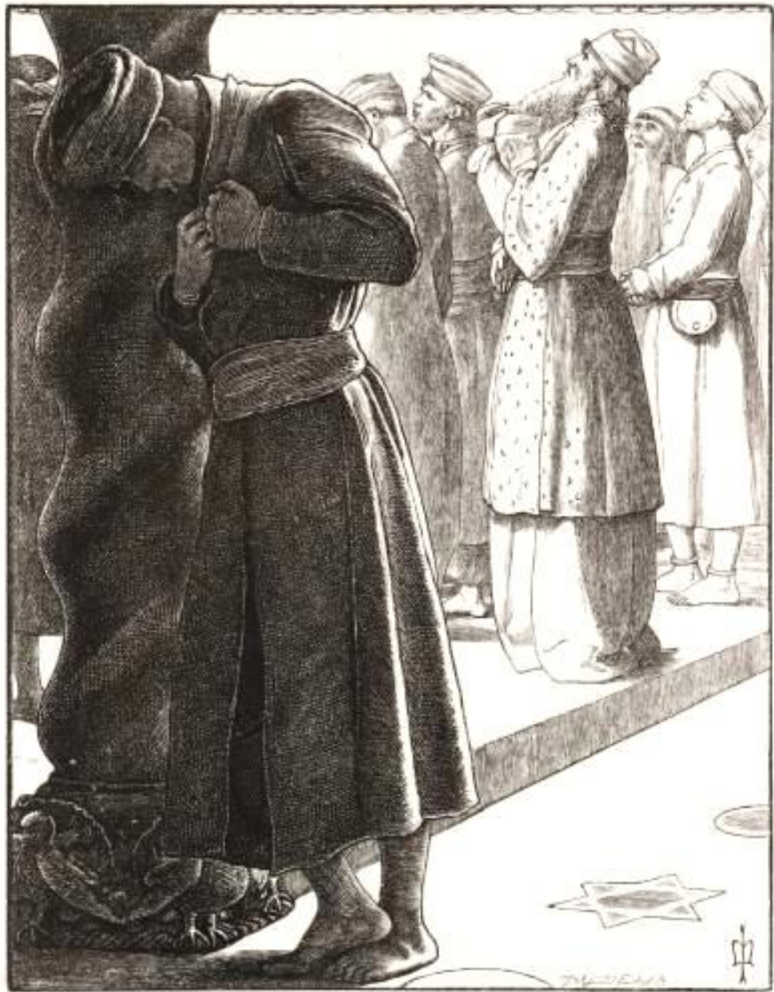
The Pharisee and the Publican

John Everett Millais Tate Britain London, England