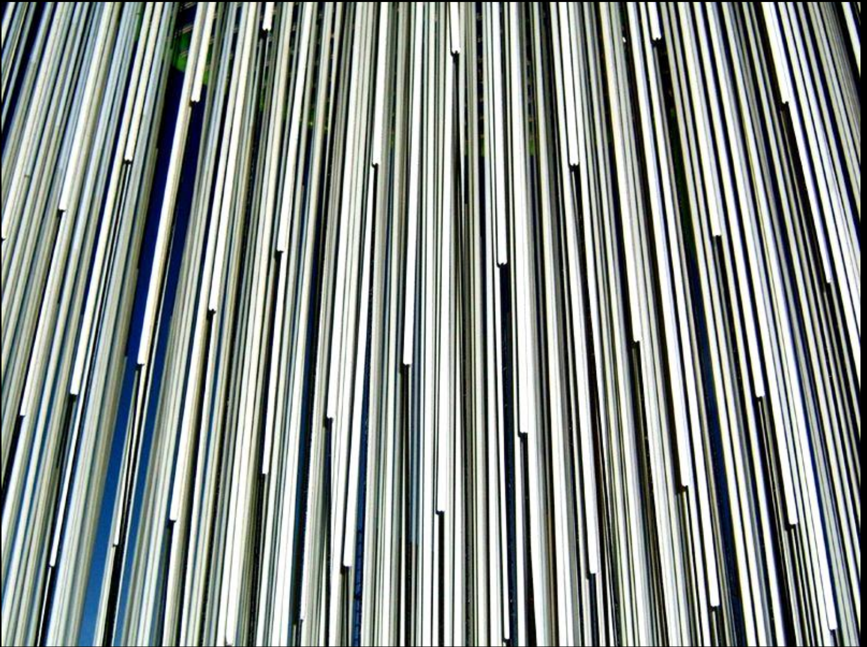
Pearl Rain -- Environmental sculpture, Jesus Rafael Soto, Pampatar, Venezuela