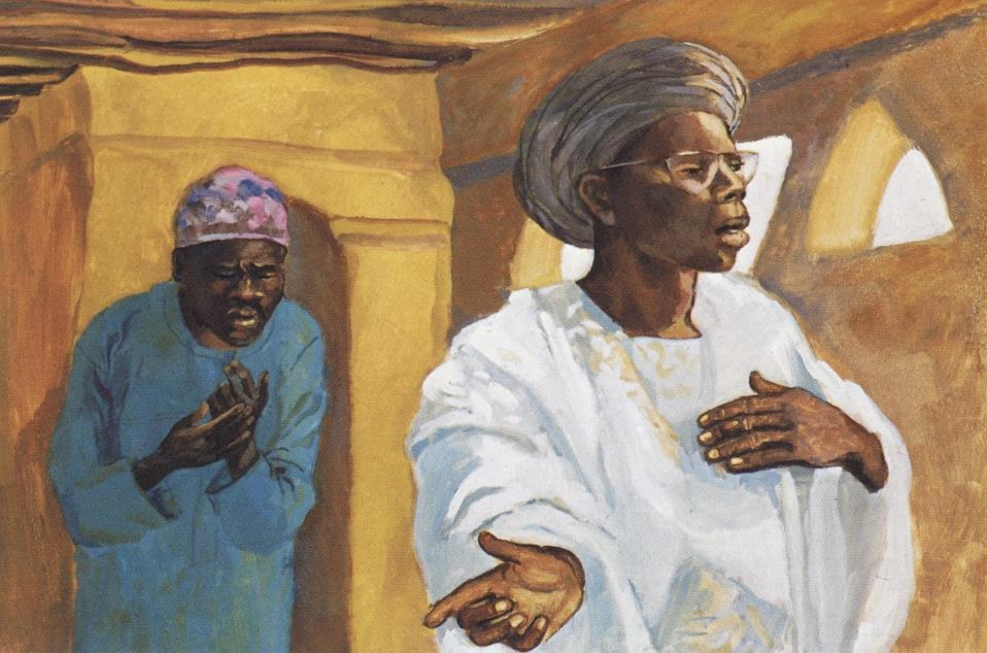
The Pharisee and the Tax Collector -- JESUS MAFA, Cameroon