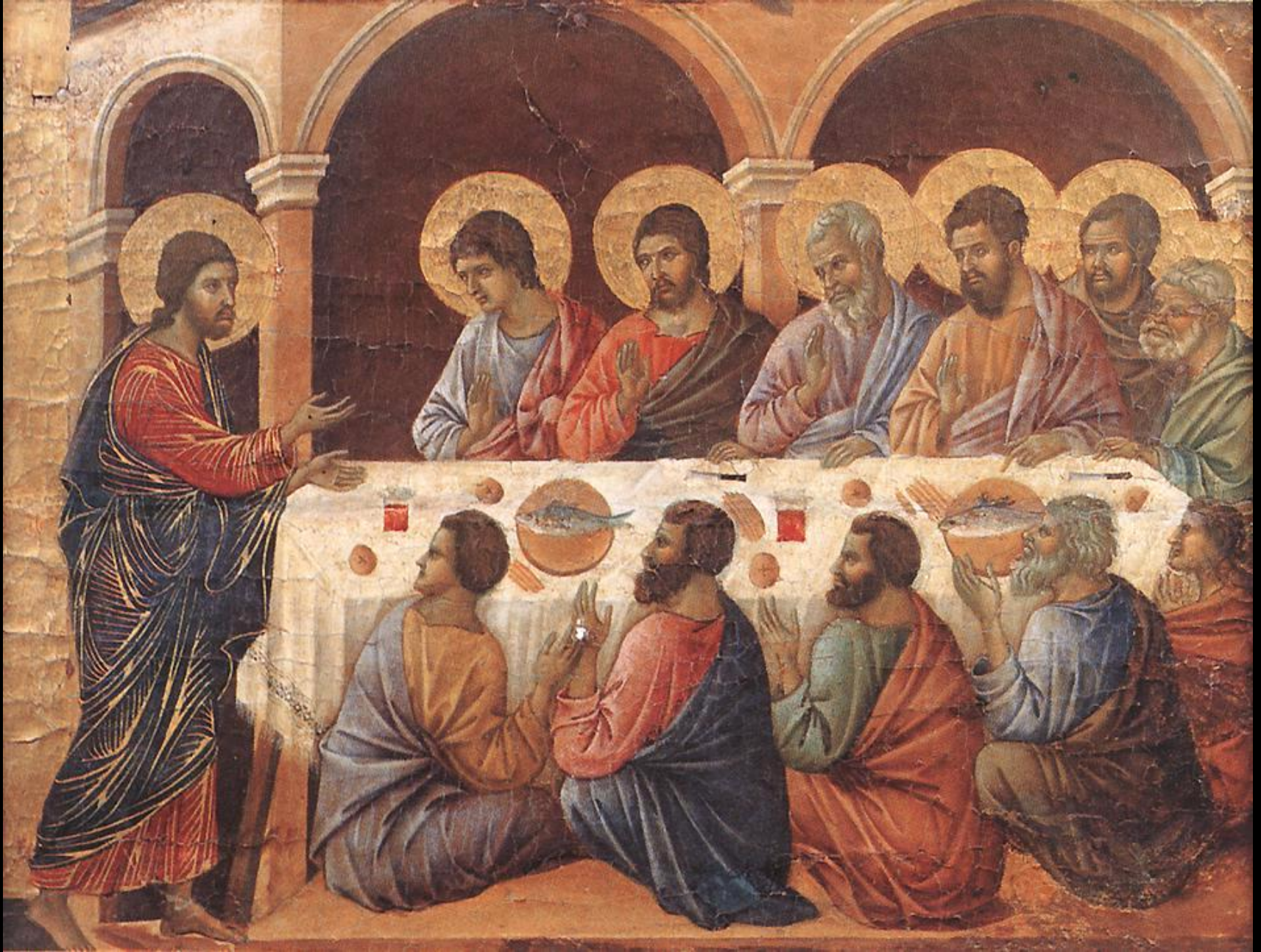
Christ Appears to the Disciples -- Duccio, Altar of Duomo, Siena, Italy