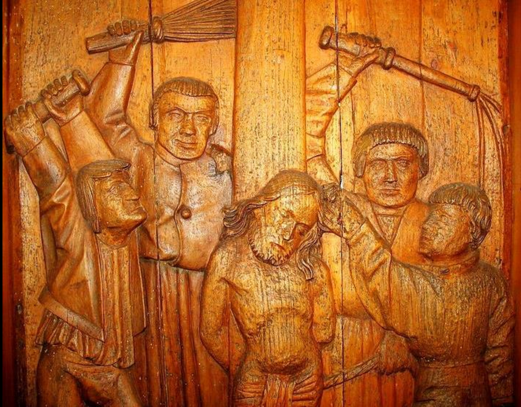
Flagellation of Jesus -- Museum Hallstatt, Hallstatt, Brazil