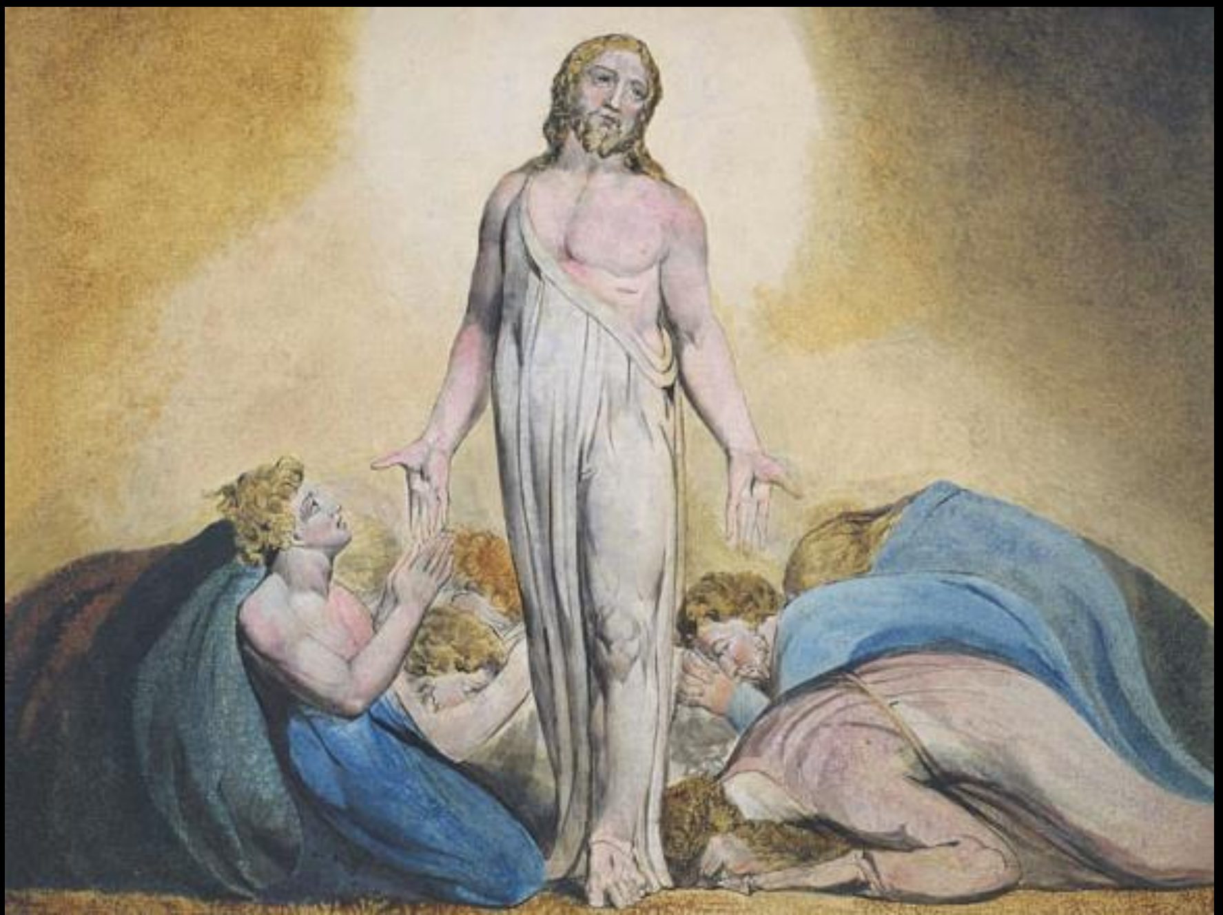
Christ Appearing to His Disciples -- William Blake, National Gallery of Art, Washington, DC