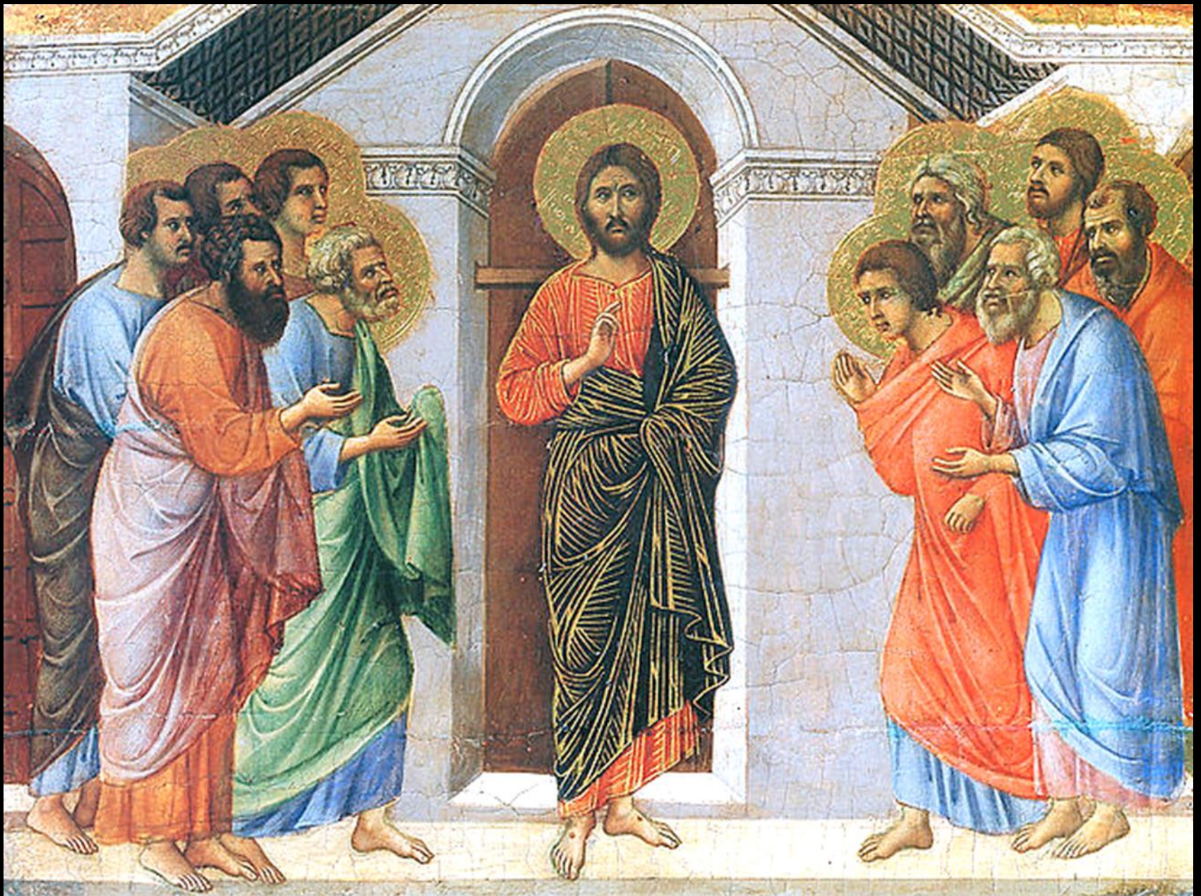
Christ Appears to the Apostles -- Duccio, Museo dell'Opera del Duomo, Siena, Italy