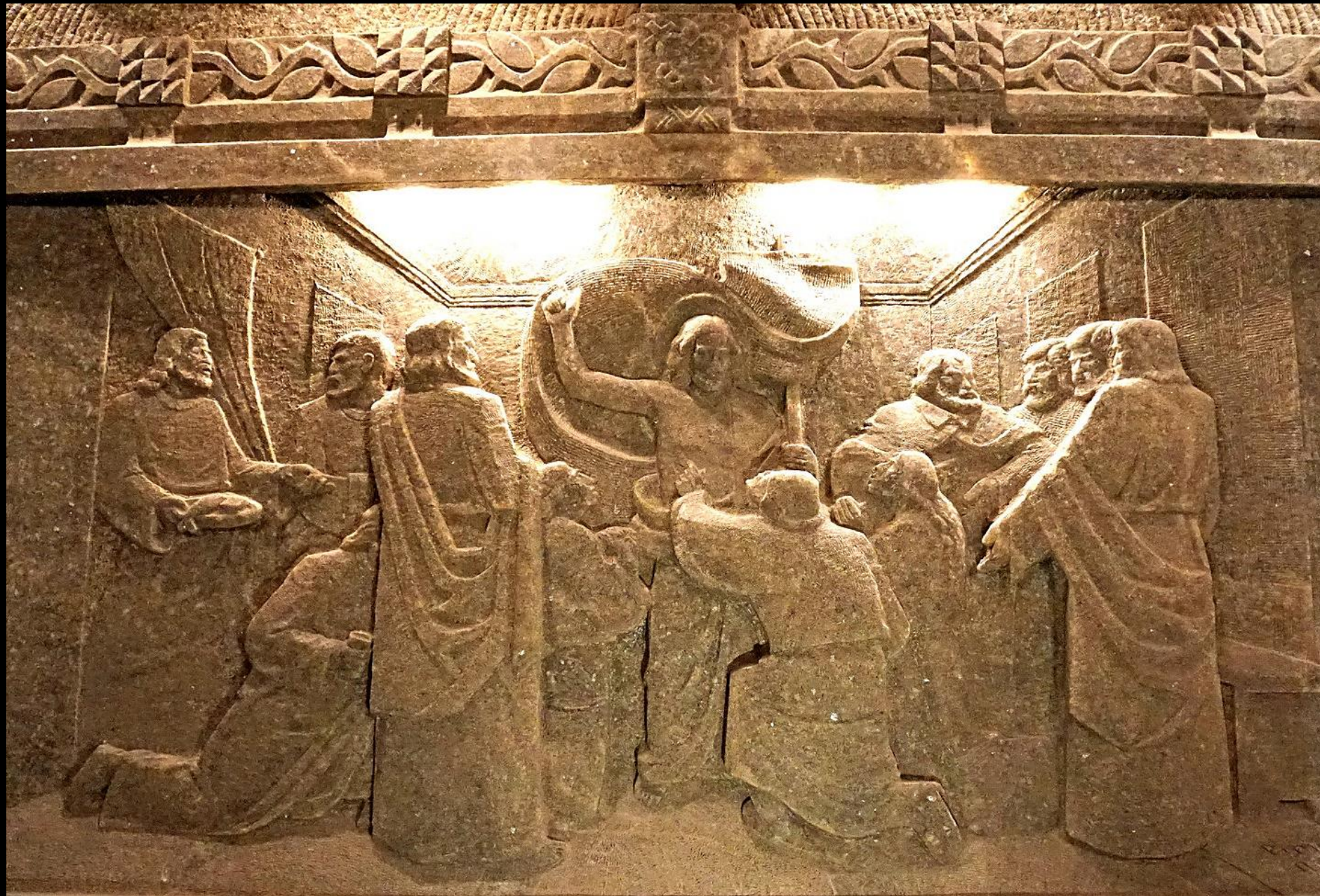
Christ Appears to Disciples -- Salt Mines Cathedral of Bogucice, Poland